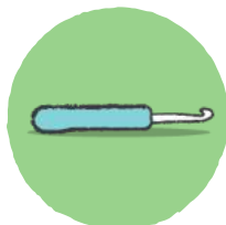
4mm crochet hook