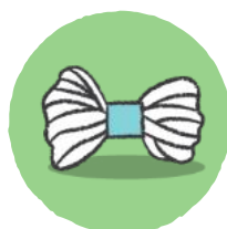
Red medium-weight yarn (3 yds)