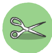
Scissors (not included)