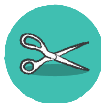
Scissors (not included)