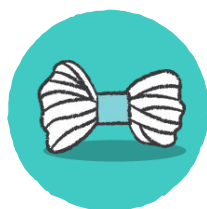
Purple medium-weight yarn (5 yds)