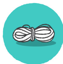
Tan medium-weight yarn (3 yds)