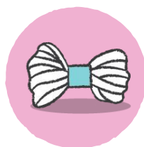
Brown medium-weight yarn (8 yds)