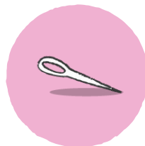
Tapestry needle (not included)