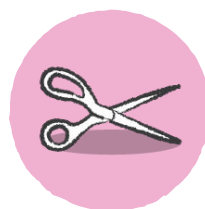
Scissors (not included)