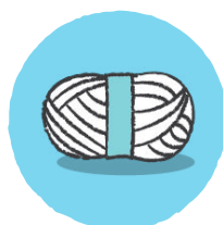
Gray medium-weight yarn, with 3 stitch markers in it (33 yds)