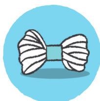
Pink medium-weight yarn (6 yds)