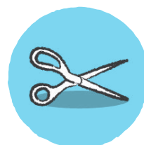
Scissors (not included)