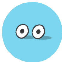
10mm safety eyes