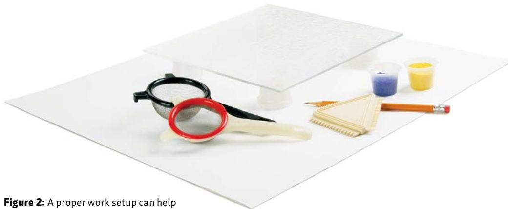
Figure 2: A proper work setup can help minimize waste and prevent accidental spills.

Note: This firing cycle was used for our example pieces, which all have thin, even applications of frit and/or powder. If your project includes application of uneven piles of frit and/or powder, you should slow the rate of heat in Segment 1 to prevent breakage from thermal shock. For instance, try 100°F/hr (56°C/hr).