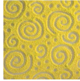
9. Yellow Fine Spiral