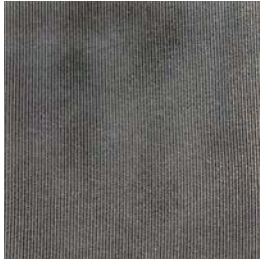
7. Black Reeded Texture