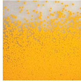
3. Yellow Coarse Fading Color Field