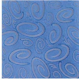
2. Blue Powder Spiral