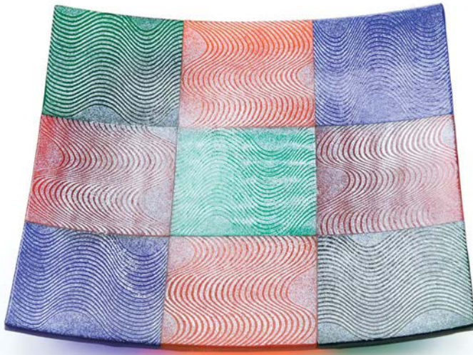
Figure 1: Fused and slumped plate with sgraffito surface, 1.5" x 9.375" x 9.375" (3.8 x 23.8 x 23.8 cm).

Working with a palette of glass frit, powder, and stringers, you can create unique sheets of art glass to use in stained glass or fusing projects.