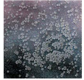
5. Starry Sky