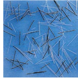
4. Blue Powder and Stringer Bits