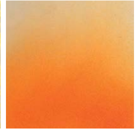
10. Orange Powder Fading Color Field