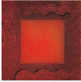
1. Red Sgraffito Square