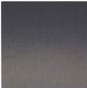
1429 LIGHT SILVER GRAY