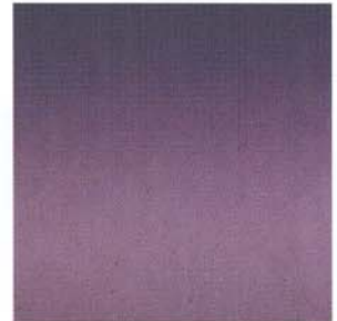
1428 LIGHT VIOLET