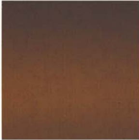
1409 LIGHT BRONZE