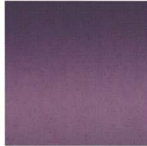
1428 LIGHT VIOLET