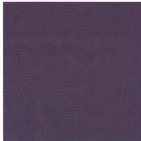
0303 DUSTY LILAC

See the other side of this sheet for a simple way to double this color palette!