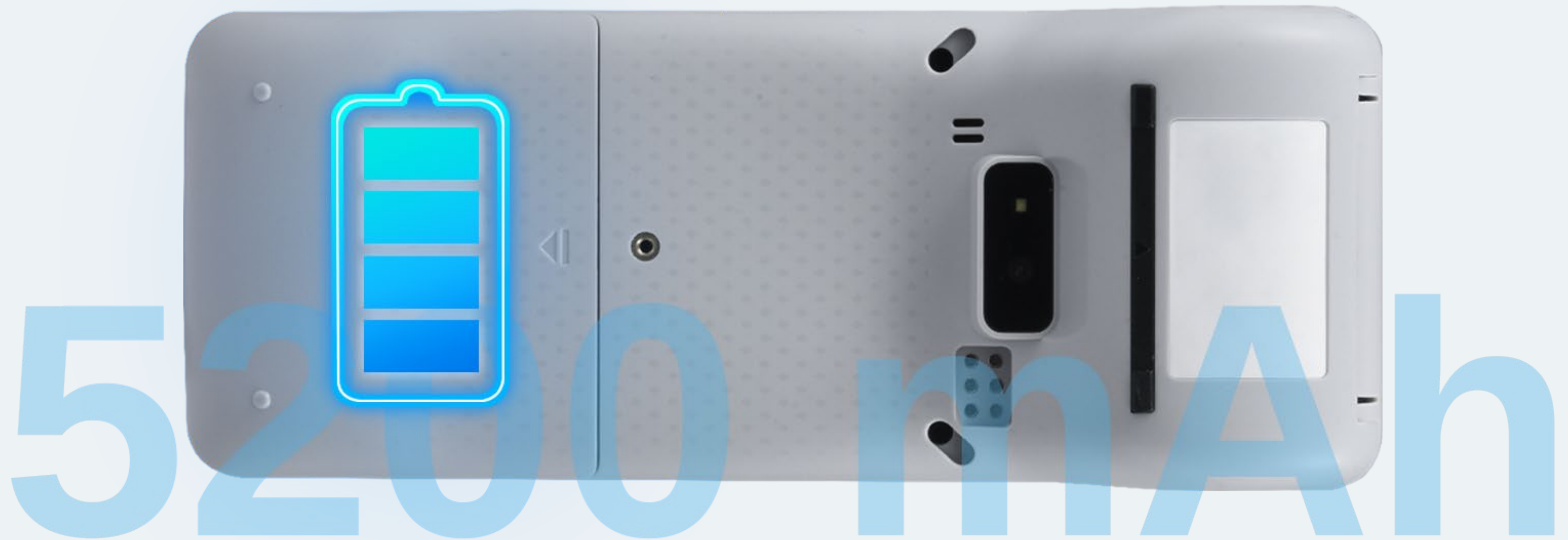
Rechargeable li-ion battery