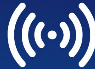
Dual-band Wi-Fi 2.4G&5G

When using the N82, dual-band Wi-Fi and dual SIM give users the option of two frequency bands and a stronger signal. Furthermore, double backup ensures that transactions always run smoothly.