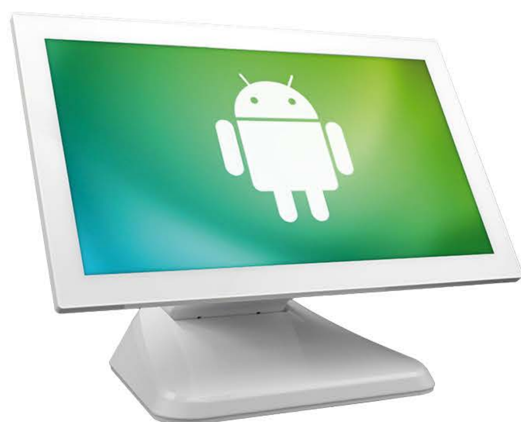
Slim Fanless Design

The TEAMSable 15N-RM-WH Android POS terminal is the newest addition to our innovative line of advanced Android based POS products. The 15N-RM-WH comes loaded with features wrapped up in a modern, stylish housing that is sure to complement any POS system install. Its 1080P high resolution PCAP touchscreen offers best-in-class performance, and at its heart is a blazing fast A17, Quad Core 1.8GHz CPU that can easily handle the most demanding applications. The 15N-RM-WH is a smart choice for a cost-effective, high performance POS terminal that adds value and superior functionality to any business.