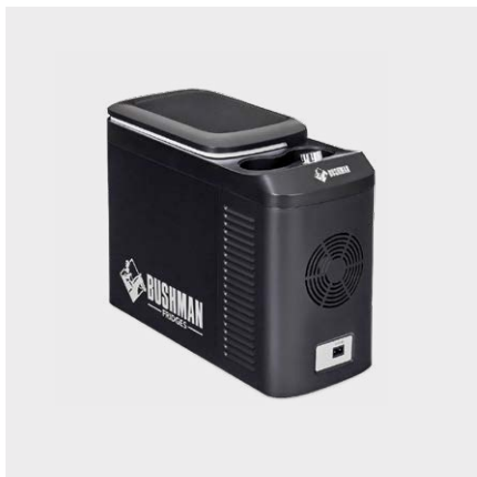
Roadie 15L 12V / 24V FRIDGE / FREEZER