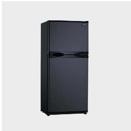
DC190L 190L 12V / 24V