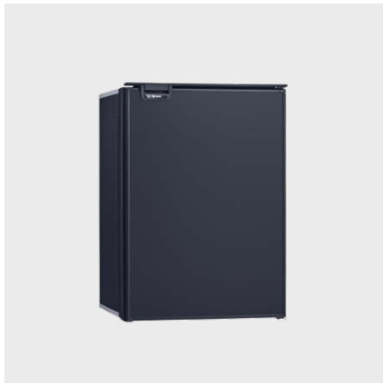
DC130X 130L 12V / 24V