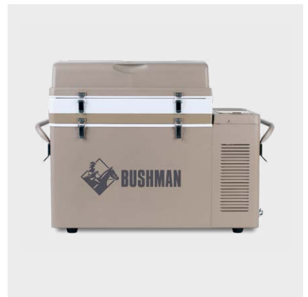
Original Bushman SC35-52 35L-52L 12V / 24V FRIDGE / FREEZER