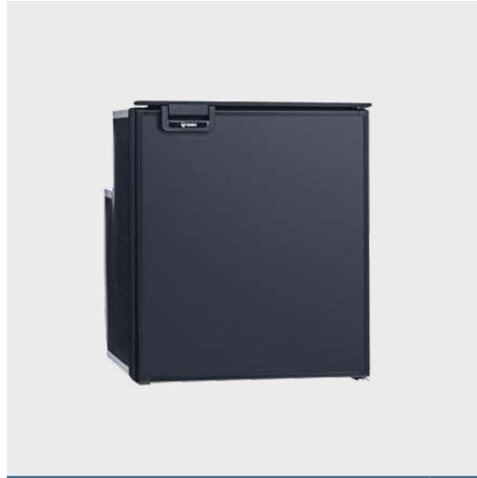
DC65X 65L 12V / 24V