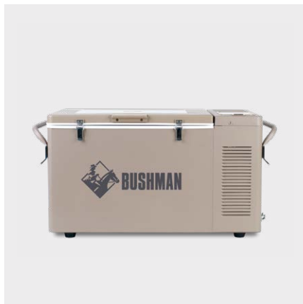
Original Bushman SC35 35L 12V / 24V FRIDGE / FREEZER