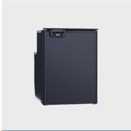
DC50X 50L 12V / 24V