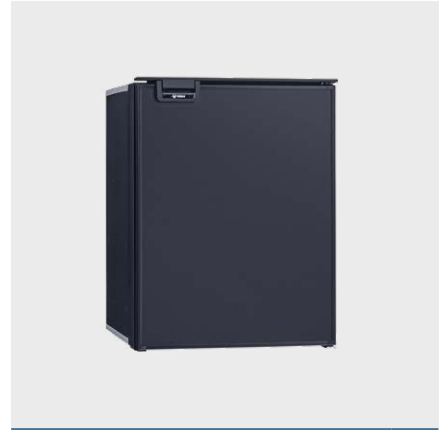
DC85X 85L 12V / 24V