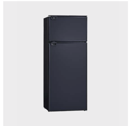
DC230X 230L 12V / 24V