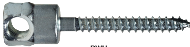
RWH Horizontal Wood Rod Hanger