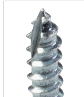
Type-17 point for use in wood