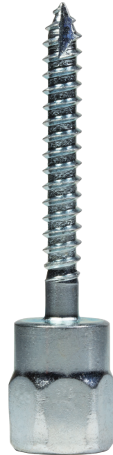
RWV Vertical Wood Rod Hanger