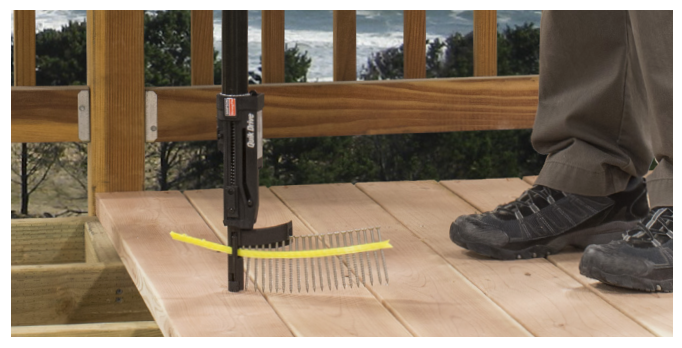
Deck-Drive DWP Wood SS for general wood-to-wood applications

The DWP Wood SS screws were designed to provide fast, easy installations in high-exposure environments so you can truly build to withstand the elements. Available in corrosionresistant Type 305 and Type 316 stainless steel, the DWP Wood SS screws are great for a variety of applications involving decks, docks, boardwalks and general exterior wood construction where extra weather resistance and long-lasting quality are critical.