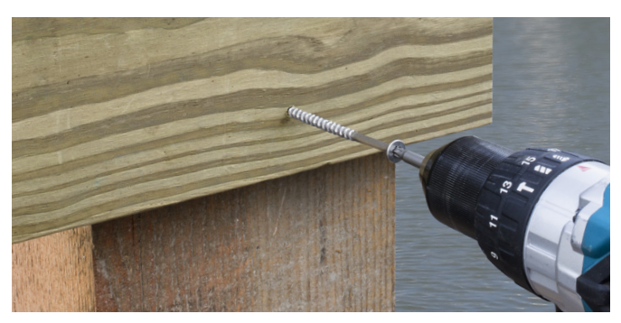
Strong-Drive DWP Wood SS for engineered/structural applications