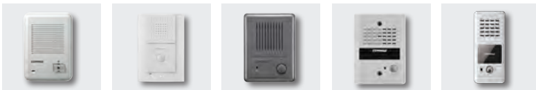
AUDIO DOOR UNIT DR-201D AUDIO DOOR UNIT DR-2L AUDIO DOOR UNIT DR-2K AUDIO DOOR UNIT DR-2GN AUDIO DOOR UNIT DR-2PN