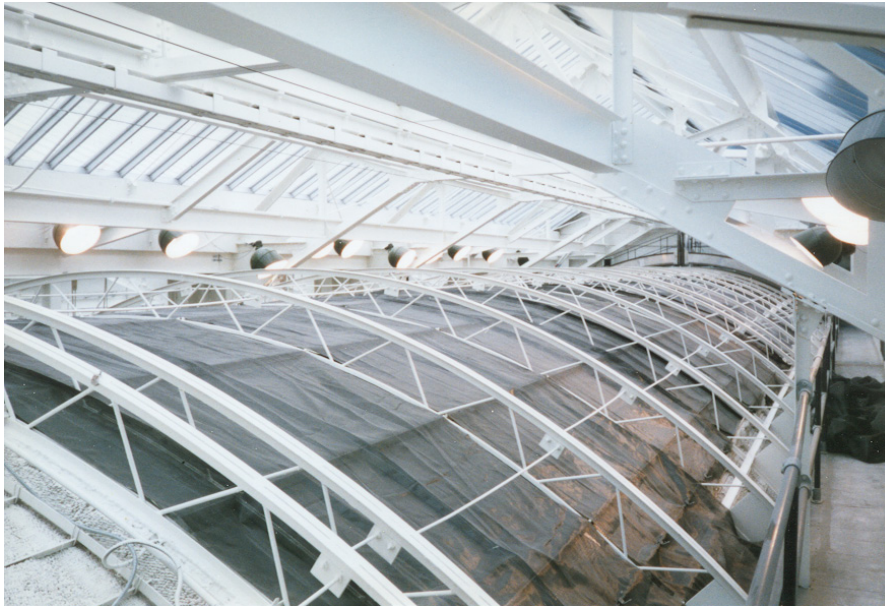
Lead-painted steel coated with LBC, National Gallery of Art, Washington, DC

the New York State Department of Health, and meets or exceeds the abatement requirements of all 50 states.