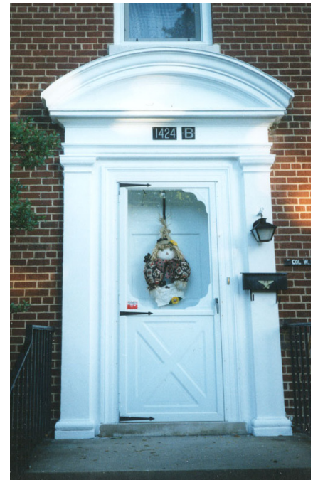
LBC over wood door frames at Fort Knox, KY.

This warranty does not extend to, nor shall Fiberlock Technologies be liable for any damage resulting from any abuse of the encapsulated surface by the tenants or occupants, improper maintenance, water damage, or other conditions beyond Fiberlock Technologies' control. The sole and only liability under this warranty shall be, at Fiberlock Technologies' option, either to replace the product if proved defective or to refund the purchase price paid. Fiberlock Technologies shall not be held liable for any incidental damages, or for any consequential damages to property, or any losses of revenue which may have been caused by a defect or failure of the product. The purchaser of this product must notify Fiberlock at 150 Dascomb Road, Andover, Massachusetts 01810 (800-342-3755) within 45 days to advise of any suspected manufacturing defects. This warranty gives the purchaser specific legal