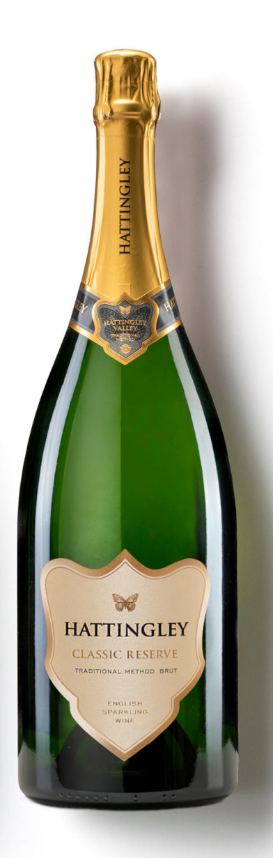
CLASSIC RESERVE NV RRP £85