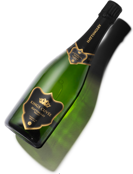
KINGS CUVÉE 2015 RRP £85/£90

With an attractive pale golden colour and fine mousse, our Kings Cuvée has vibrant citrus zest aromas layered with honey and nuts, all smoothly integrated with creamy oak. Deep and rich, yet with a refreshing palate of bright, crisp acidity and a long, complex finish.