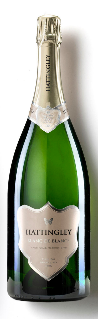
BLANC DE BLANCS RRP £120