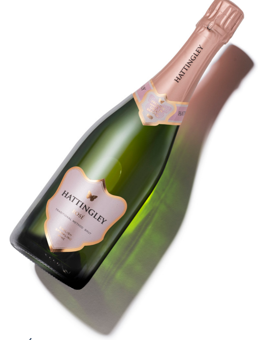
ROSÉ 2019 RRP £41/£46

A very delicate pale pink colour. Bright red fruit, strawberries and raspberries with a note of pomegranate on the nose.