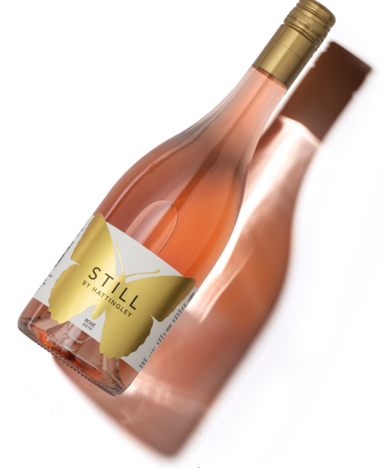
STILL - ROSÉ RRP £20

A beautiful pale salmon pink colour with vibrant notes of, pomegranate, strawberries and raspberries on the nose and hints of freshly cut hay. On the palate, fresh cherries and raspberries compliment a lovely texture that lingers in the mouth - an absolute favourite for all Rosé fans.