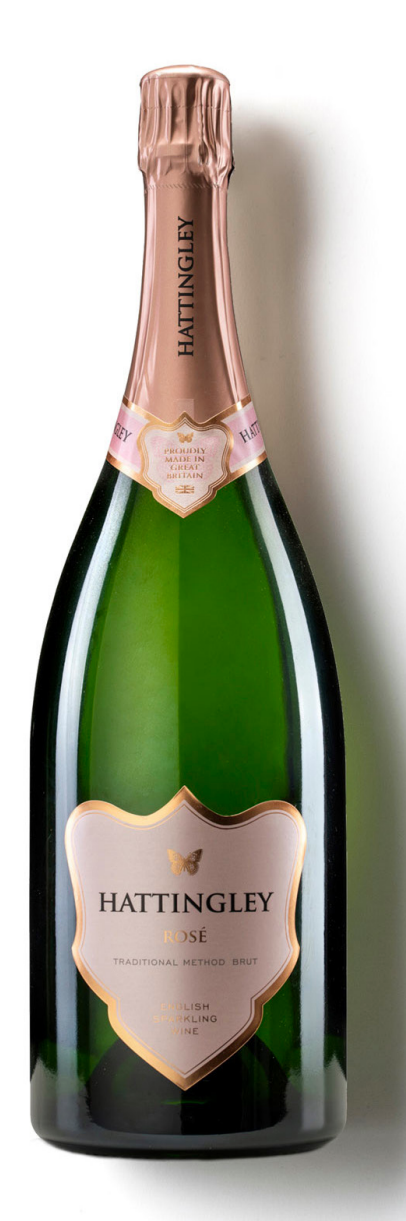
ROSÉ RRP £100

Volume discount pricing available, please advise of your requirements for a bespoke quote.