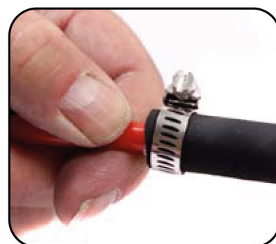
Tighten jubilee clip onto rubber fuel line, over brass insert.