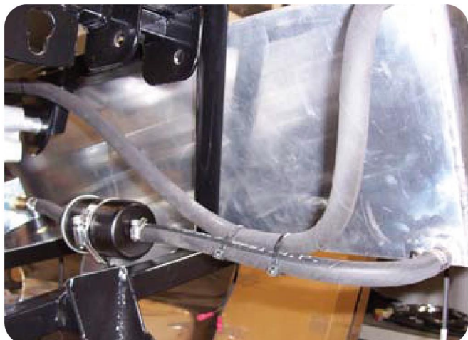
Photo shows suggested route for feed from tank to fuel filter. Return pipe from the top of the tank to front of the car, joining plastic fuel pipe in photo below.