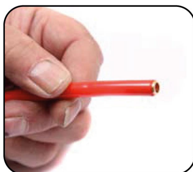
Push insert fully into plastic fuel pipe.