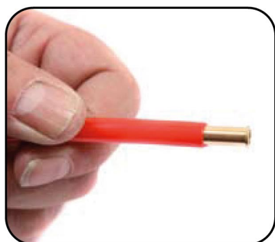
Above shows plastic fuel pipe brass insert.

See images below for joining of rubber to plastic pipe