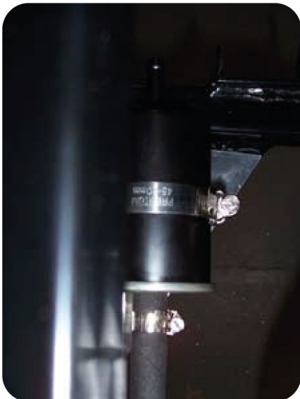
Photo shows suggested fixings of jubilee clips