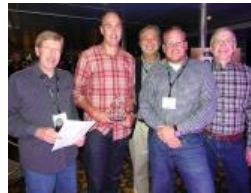
HTSA Salutes Vendors, Members At Fall Conference