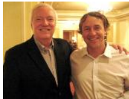
NATM's 2015 Vendor Conference