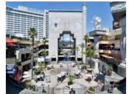
New Age Electronics' Retail Dealer Summit