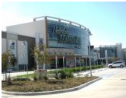
Six-Month Review: Nebraska Furniture Mart Texas