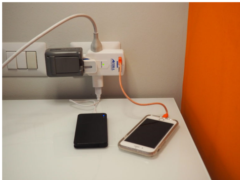
Must-Have Travel Gadgets – Accell Home or Away Power Station.