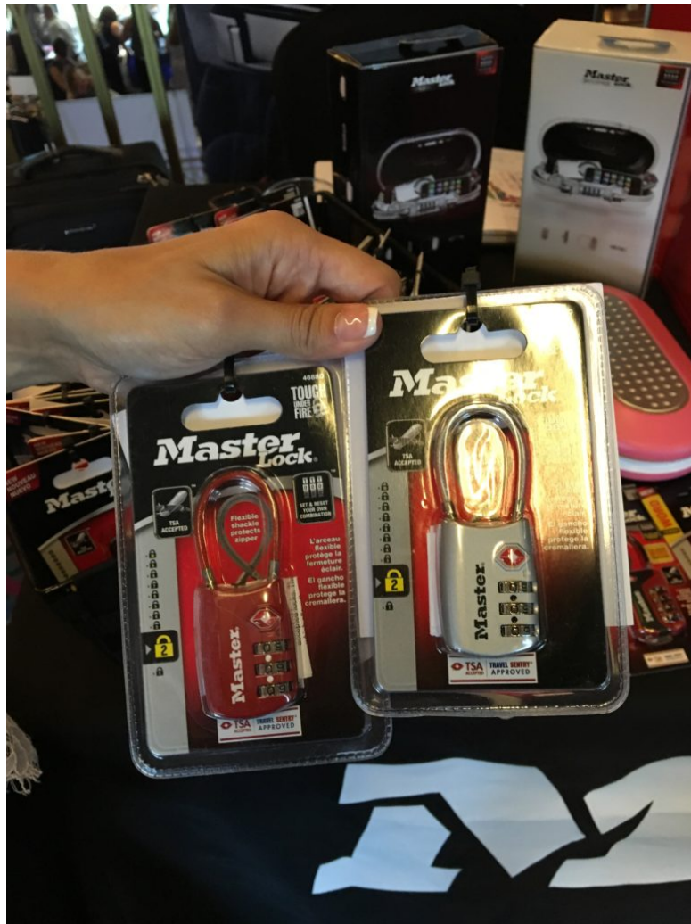
Must-Have Travel Gadgets – TSA Approved Luggage Locks