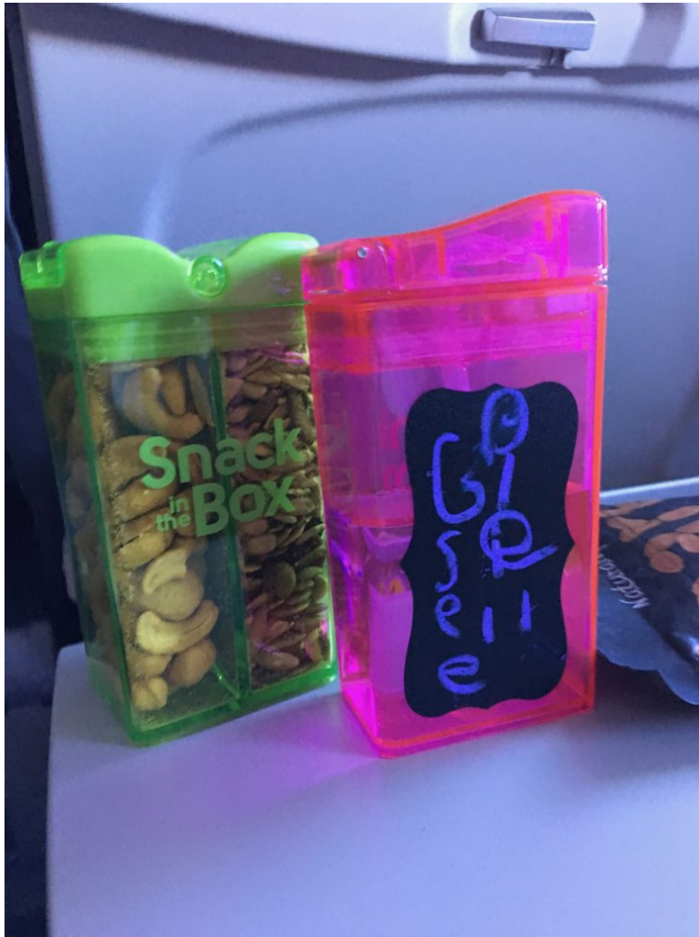
Must-Have Travel Gadgets – Snack and Drink Containers

Family trips call for family photos and sometimes you just need a selfie stick to get everyone in the photo. The best selfie sticks are Bluetooth activated and hold a long lasting charge. Another great option is a GorillaPod which can be used as a tripod or wrapped around something sturdy.