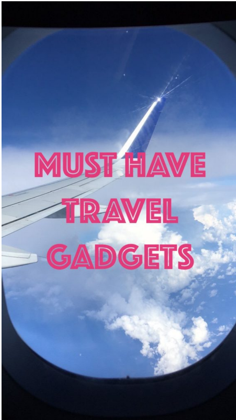
Must-Have Travel Gadgets – Globetrotting Mommy