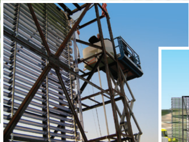
Each BioBlade unit features its own 250-gallon water tank and pump.