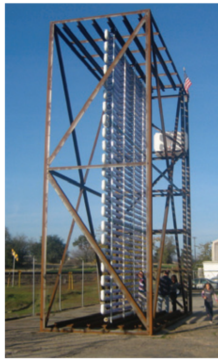
BioBlades are slid into the Photo BioReactor structure in a manner similar to computer server “blades” being slid into a chassis.

“The reasons we chose EnviroKing UV for our photobioreactor development include durability, performance, and value,” says Schuring. “Most important, however, is the fact that EnviroKing UV, although clear, blocks UV light waves that are damaging to conventional clear PVC, making it ideally suited for precisely the type of projects we’re conducting here at Ternion Bio. And EnviroKing UV ThinWall™ provides the optimum dimensions for use in photobioreactors. EnviroKing UV not only blocks harmful UV rays, but its unique wall dimensions actually improve the light transmission characteristics beneficial for enhanced algae growth.”