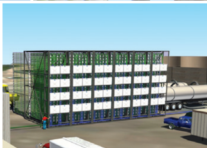
Ternion Bio's modular Photo BioReactor design can be expanded to meet increased production requirements.