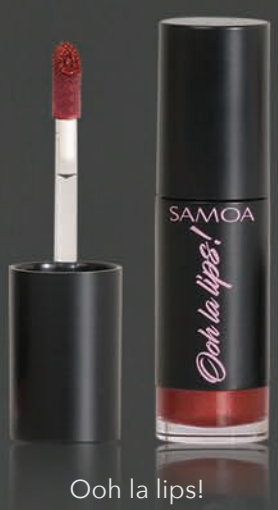
Ooh la lips! Matt liquid lipstick 518 Metallic