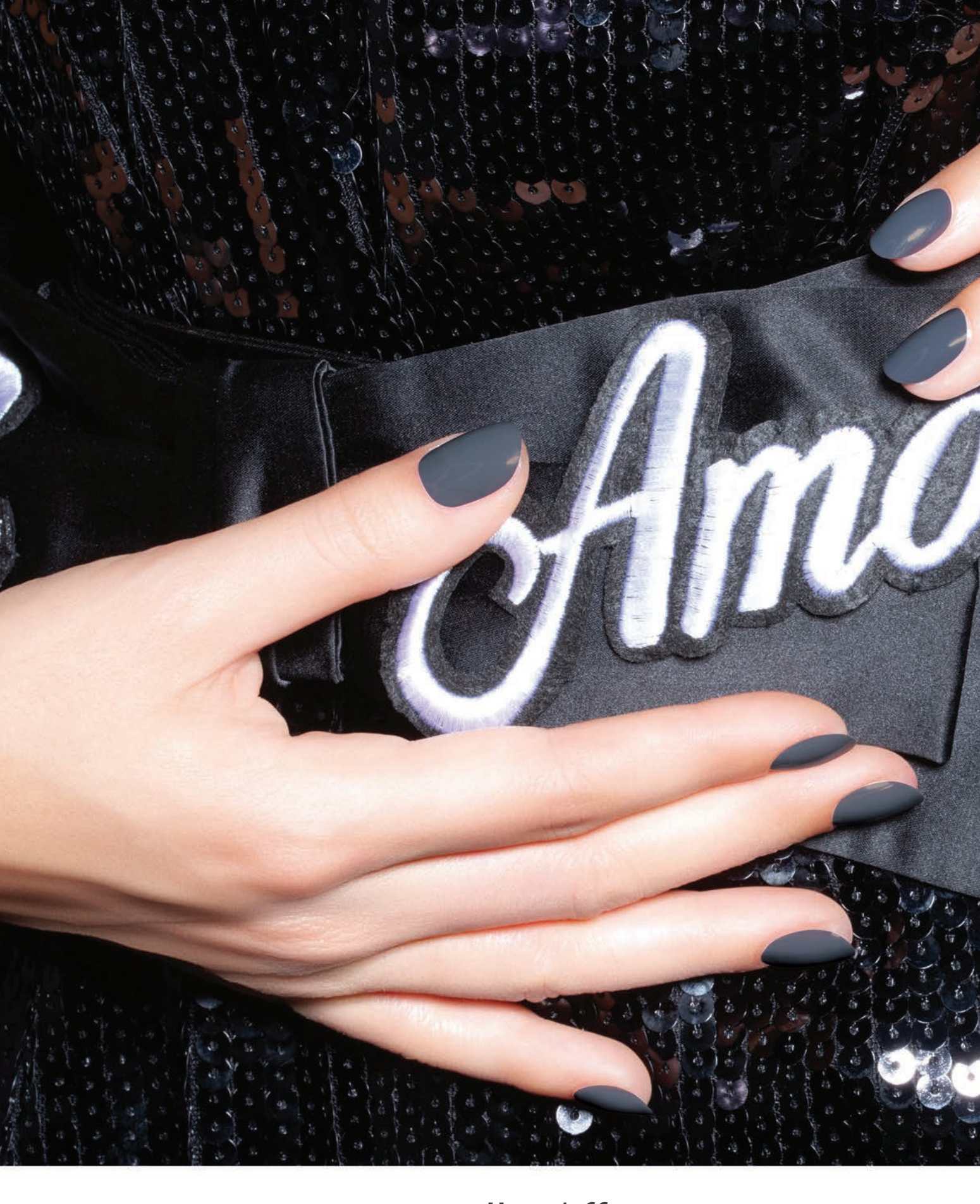
Dramatically different Hello New NEVER NUDE Shades!