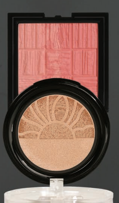
Revive blush 1 Rose Pop Rise & Shine metallic highlighter 2

Alexa Palette 12 eyeshadows Bésame khol kajal 62 Ooh La Lash! mascara