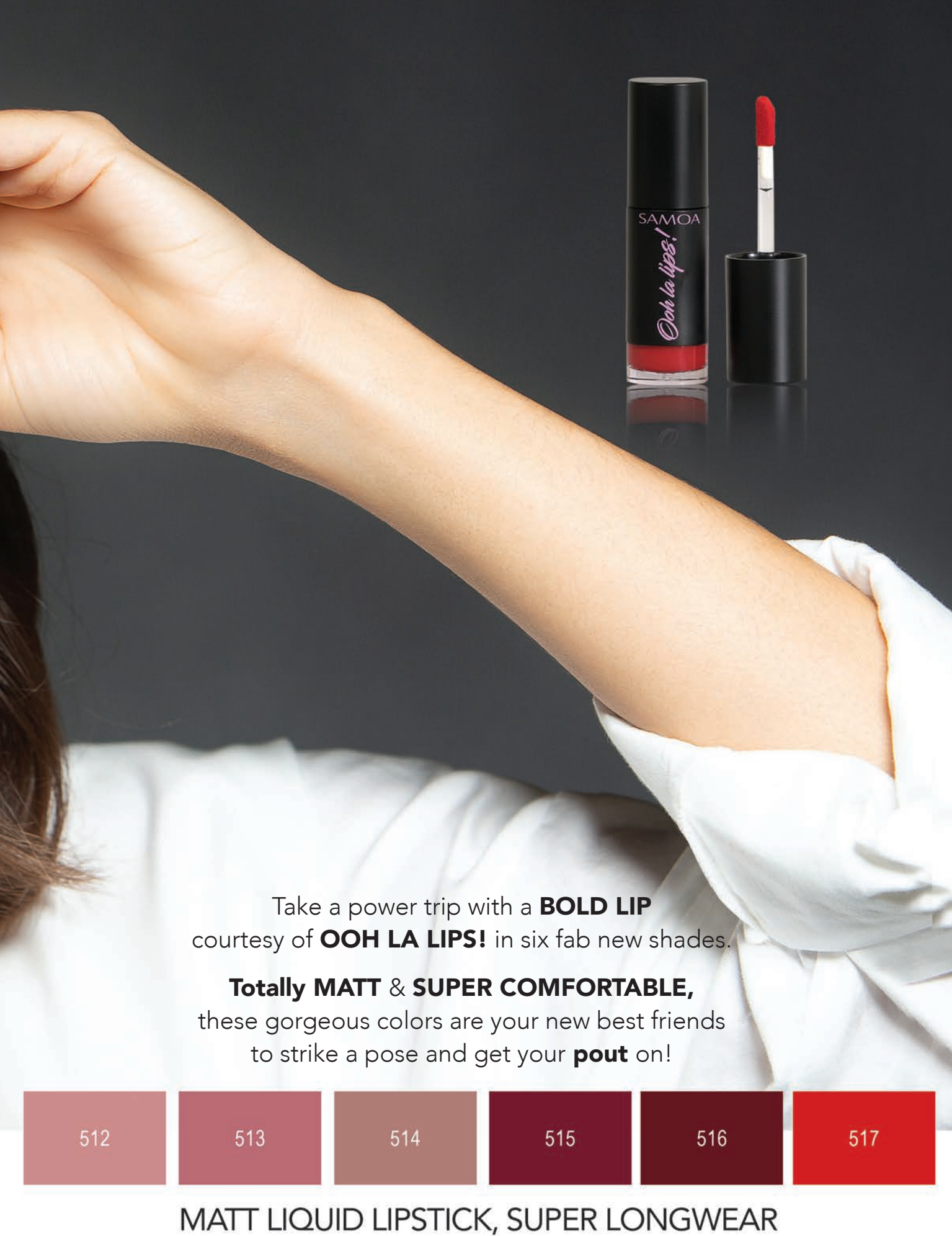
MATT LIQUID LIPSTICK, SUPER LONGWEAR Full coverage, Vivid & Velvety finish