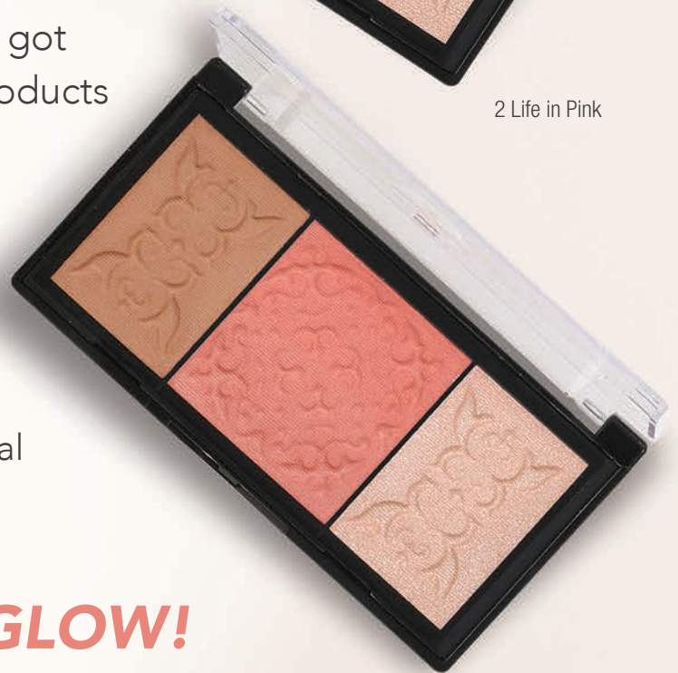
1 Life's Peach