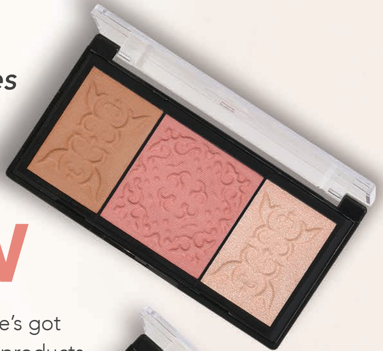
2 Life in Pink