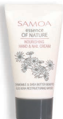
Essence of Nature Nourishing Hand & Nail Cream 15ml

2 Nail Polishes + 1 FREE Hand & Nail Cream