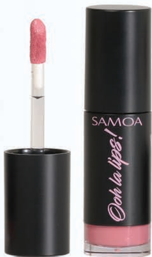
Lotus Super Longwear Lipliner 950 Ooh La Lips! Matt Liquid Lipstick 508