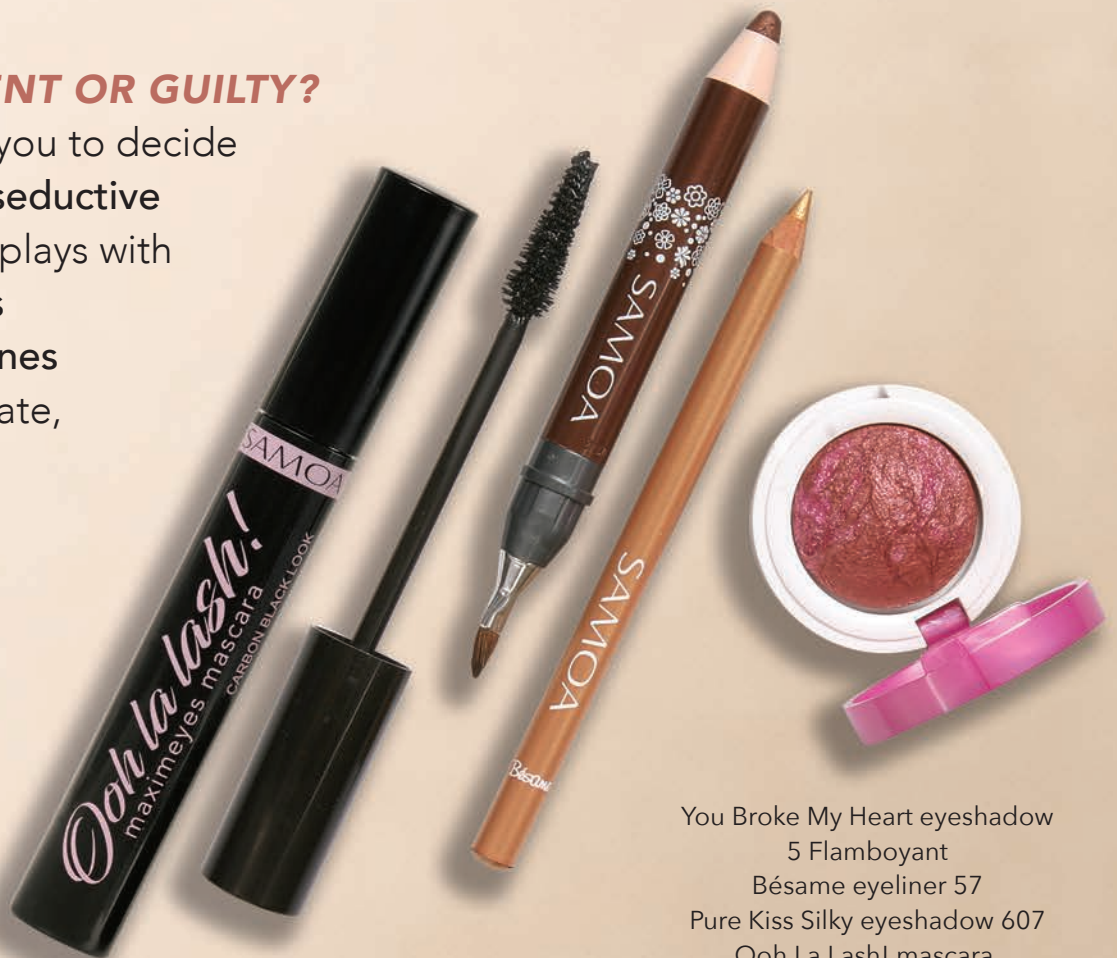
You Broke My Heart eyeshadow 5 Flamboyant Bésame eyeliner 57 Pure Kiss Silky eyeshadow 607 Ooh La Lash! mascara.

It's up to you to decide with this seductive look that plays with gorgeous earthy tones of chocolate, bronze and gold.