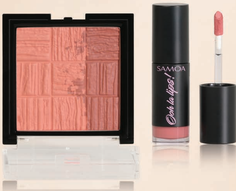
Revive blush 3 Fresh Hint Ooh La Lips! Matt Liquid Lipstick 506.