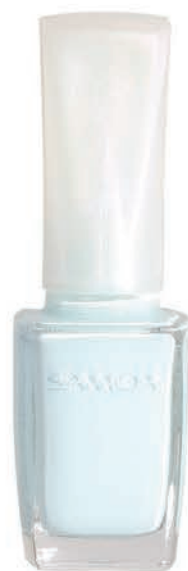
99 Paradise Beach