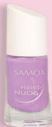
173 Orchide Me