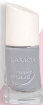
172 Try Me