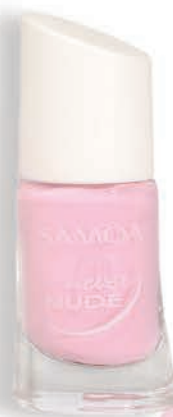
171 Coconut Cakes