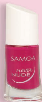
174 Mad Heat

Your smoothest summer move Don't let the heat cramp your style.