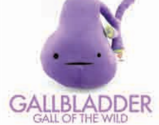
GALLBLADDER GALL OF THE WILD