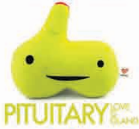
PITUITARY LOVE GLAND