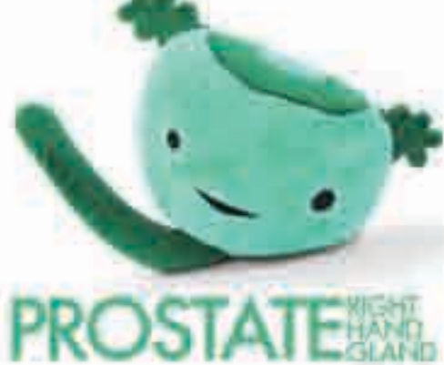
PROSTATE RIGHT HAND GLAND