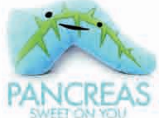
PANCREAS SWEET ON YOU