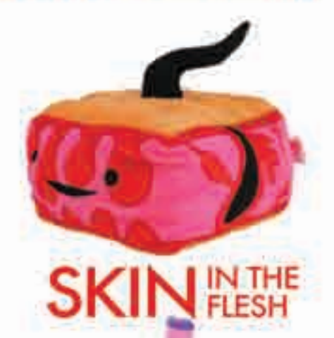
SKIN IN THE FLESH