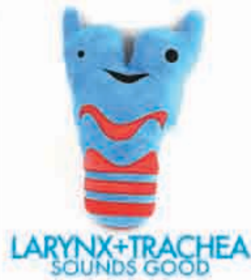
LARYNX+TRACHEA SOUNDS GOOD