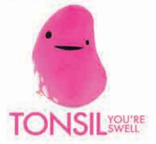
TONSIL YOU'RE SWELL