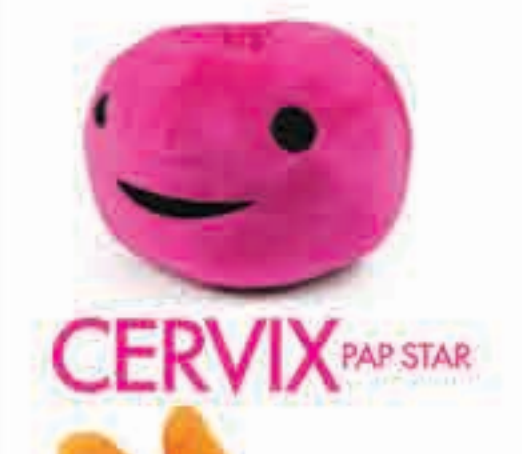
CERVIX PAP STAR