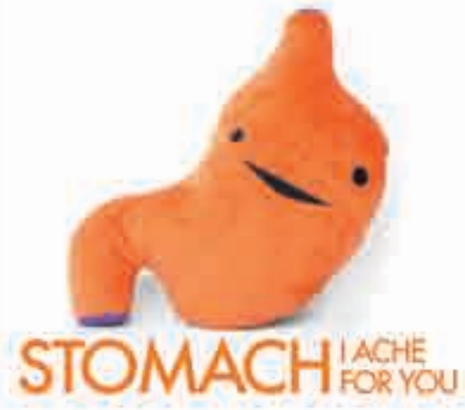
STOMACH I ACHE FOR YOU