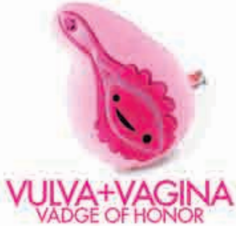
VULVA+VAGINA VADGE OF HONOR