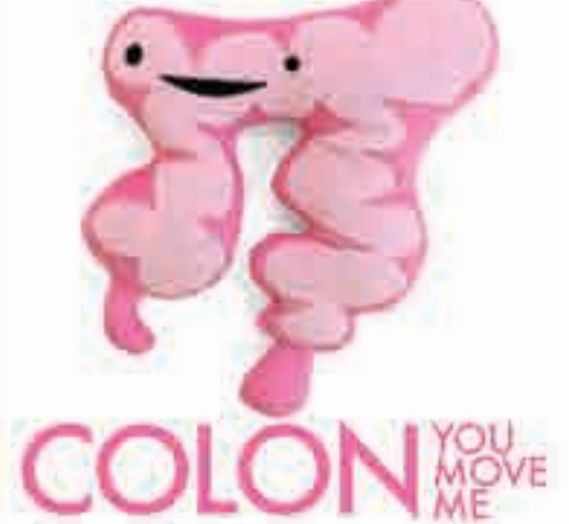
COLON YOU MOVE ME