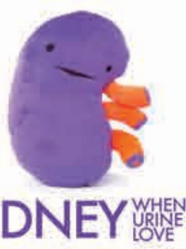
KIDNEY WHEN URINE LOVE