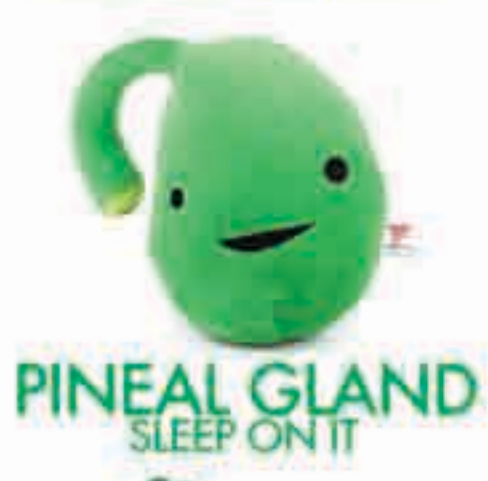
PINEAL GLAND SLEEP ON IT