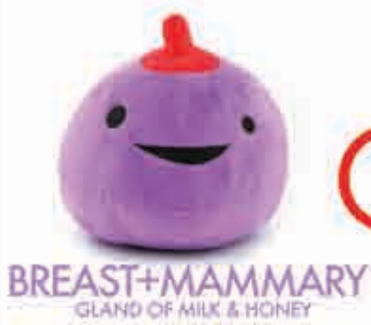
BREAST+MAMMARY GLAND OF MILK & HONEY