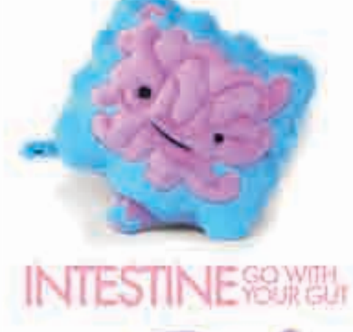
INTESTINE GO WITH YOUR GUT