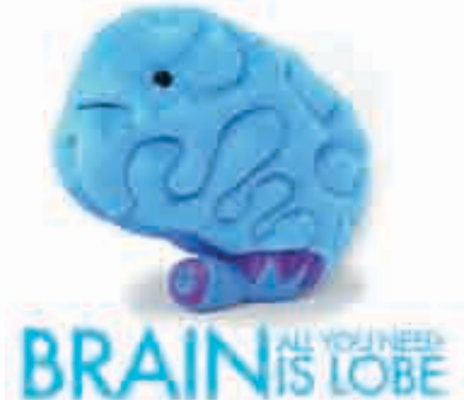
BRAIN ALL YOU NEED IS LOBE