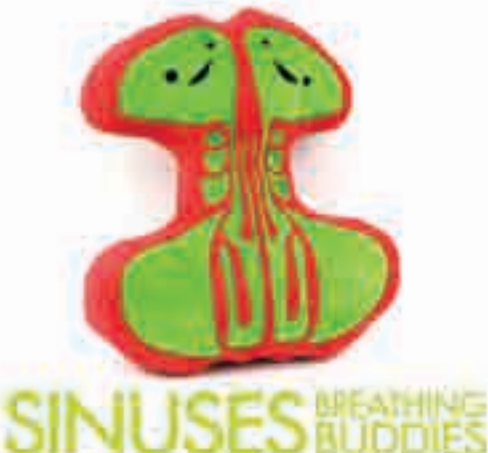
SINUSES BREATHING BUDDIES