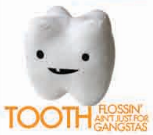
TOOTH FLOSSIN' AIN'T JUST FOR GANGSTAS