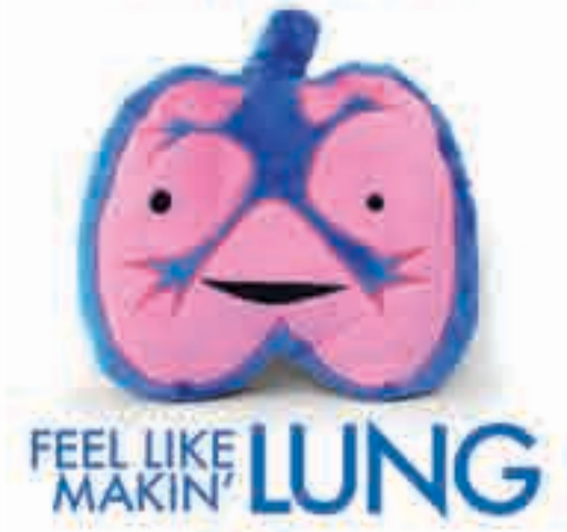
FEEL LIKE MAKIN' LUNG