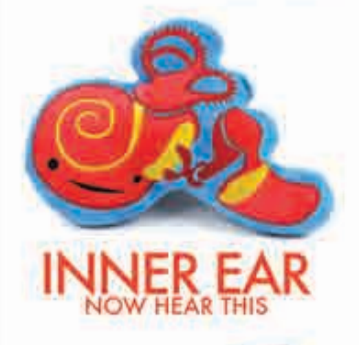
INNER EAR NOW HEAR THIS