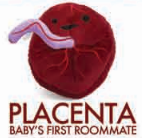
PLACENTA BABY'S FIRST ROOMMATE