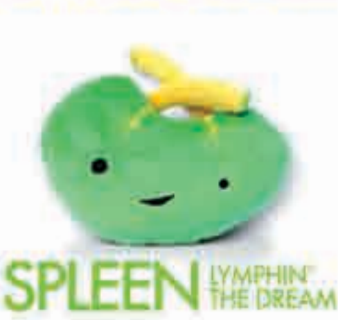
SPLEEN LYMPHIN' THE DREAM