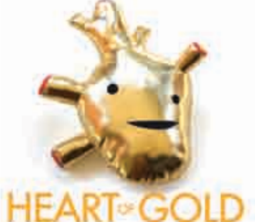
HEART OF GOLD