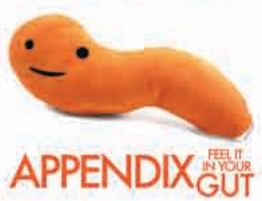
APPENDIX FEEL IT IN YOUR GUT