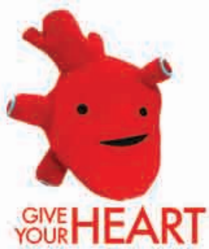
GIVE YOUR HEART