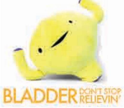
BLADDER DON'T STOP RELIEVIN'