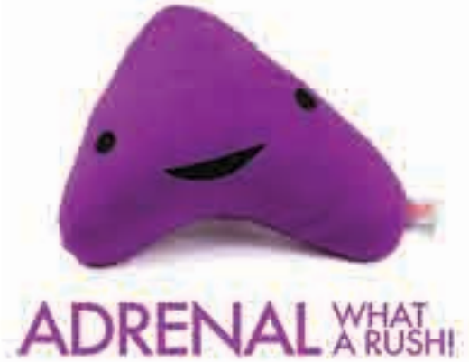
ADRENAL WHAT A RUSH!