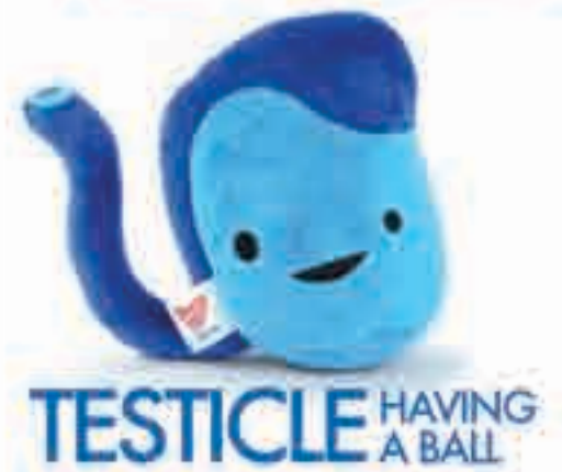
TESTICLE HAVING A BALL