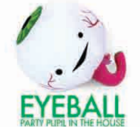
EYEBALL PARTY PUPIL IN THE HOUSE