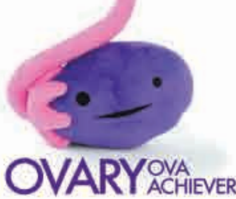
OVARY OVA ACHIEVER