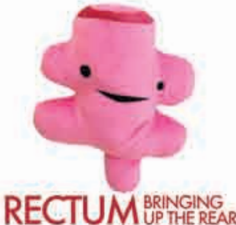
RECTUM BRINGING UP THE REAR