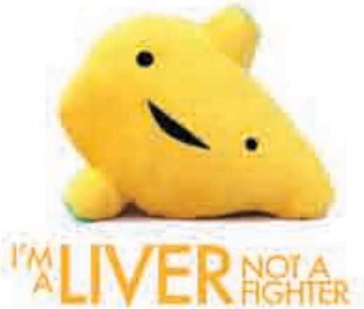
I'M A LIVER NOT A FIGHTER