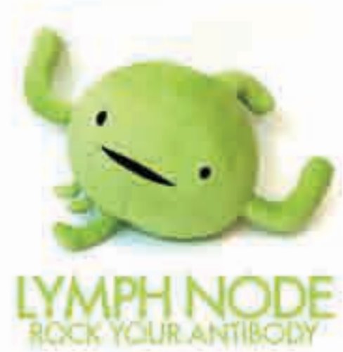
LYMPH NODE ROCK YOUR ANTIBODY