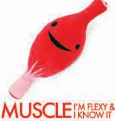
MUSCLE I'M FLEXY & I KNOW IT