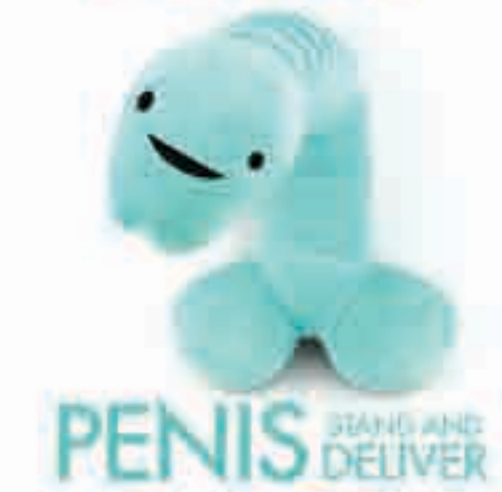
PENIS STANDS AND DELIVER