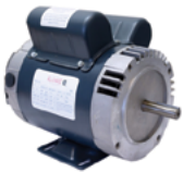
POWERFUL AC MOTOR