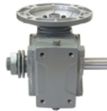
HEAVY DUTY GEARBOX WITH INTERNAL CLUTCH