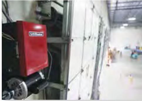
Commercial Door Operators

Use alone or with Universal Receiver (850LM/860LM) for expanded functionality