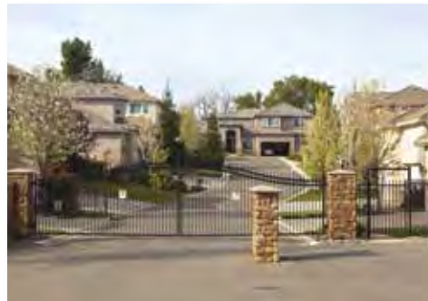
Small, Gated Cul-de-Sacs