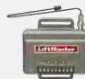
Universal Receiver (850LM/860LM)

64 in. in-ground mount pedestal, 2 x 2 in. square pipe with a black powder-coated finish, 11-gauge steel.