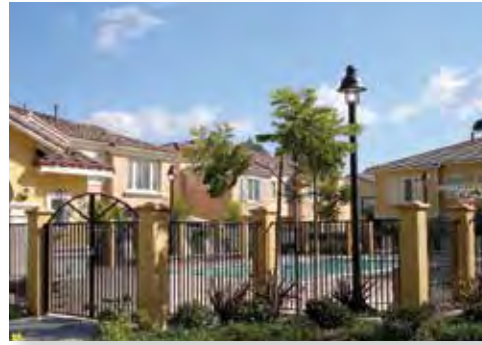
Community Pool Gates Requires Universal Receiver