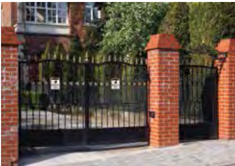
Entrances with Electronic Locks Requires Universal Receiver