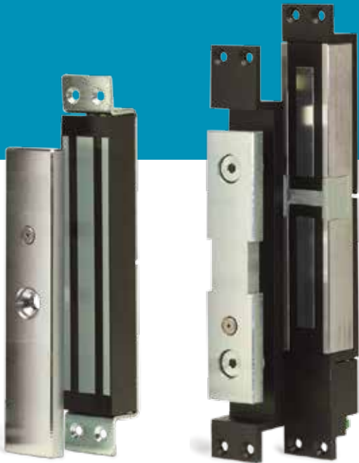
DKML-S3 300 Lb Armature and Maglock