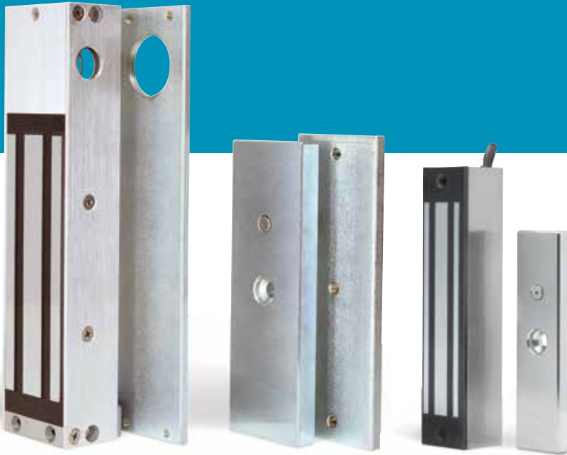
DKGL-S12 1200 Lb Maglock and Armature with Welding Mounting Brackets

600 and 1200 Lb (272 and 544 Kg) lock strength