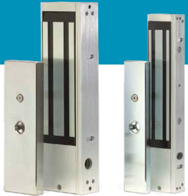
DKML-S12 1200 Lb Armature and Maglock

300, 600, 1200, and 2000 Lb lock strength (136, 272, 544, 907 Kg)