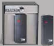
Stand Alone Card Readers