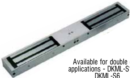
Available for double door applications - DKML-S12 and DKML-S6