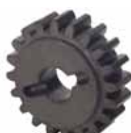
Pinion Z20 for rack