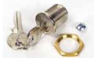
Release lock with customised key from no. 1 to no. 36

Item code from 712751 to 712786 Price (euro)