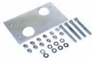
Foundation plate with side and height adjustments