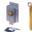
Various accessories page 194