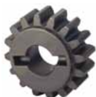
Pinion Z16 for rack