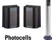
Photocells and Columns page 189