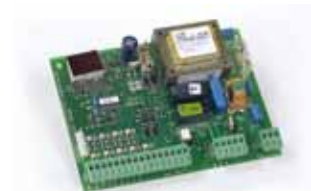
Control board 578 D (remote installation) Technical specifications page 153