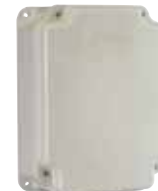
Enclosure mod. E for control boards