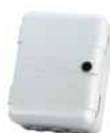
Enclosure mod. L for control boards