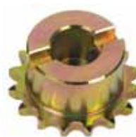
Pinion Z16 for chain