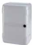
Enclosure mod. LM for control boards