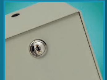
Weigand Controller add your own 26-bit wiegand device for use in a stand-alone application