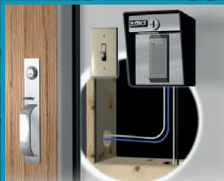
Simple Wiring easily connects to most electric strikes and magnetic locking devices