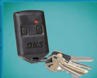
ProxMitters Combines a RF Transmitter with a proximity card tag