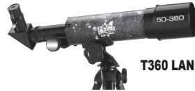
T360 LAND & SKY

Explore our other EduScience optics products