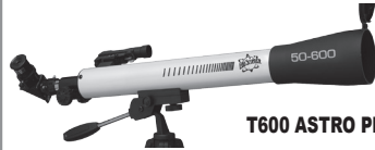
T600 ASTRO PRECISION