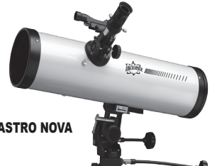
T1000HD ASTRO NOVA