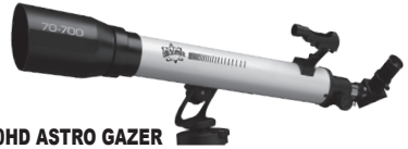
T700HD ASTRO GAZER