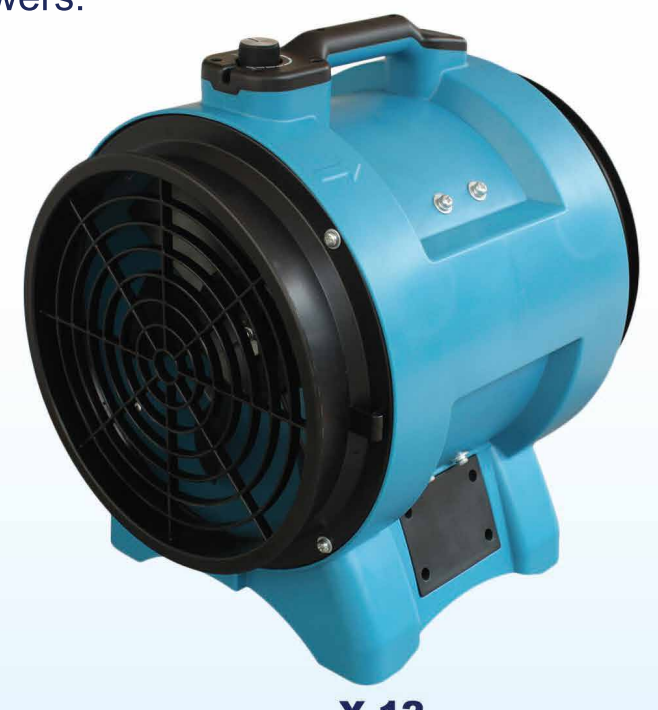
X-12 12" DIAMETER AIR OUTLET