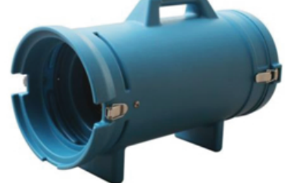
8DHC DUCTING HOSE CARRIER FOR 8DH25