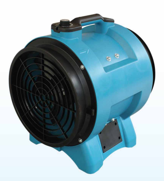
X-8 8" DIAMETER AIR OUTLET

Introducing the X-8 and X-12 Confined Space Ventilator Fans! THE ONE and THE ONLY confined space fans that offers a complete control of both air velocity and air volume with a variable speed control switch. These fans can handle any narrow space with their 8" or 12" diameter flex hoses ducting air up to 125 ft. Just like all the XPOWER products, the X-8 and X-12 are super lightweight and compact. Their low amp and powerful, sealed motors can efficiently deliver dry air to ventilate, create negative air pressure or simply to help complete any drying process for a wide variety of construction applications. The X-8 and X-12 can be used without hoses to create high volume air circulation in gyms, hallways and other large areas. With its ducting hose, the X-8 and X-12 are the perfect fans to deliver a continuous flow of fresh air to subterranean manholes and sewers.