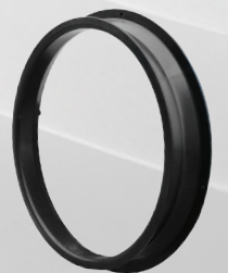
Adapter Kit (For X-41ATR & X-42ATR Only)