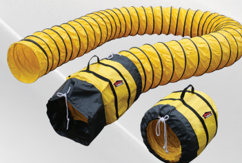
Ducting Hose (For X-41ATR & X-42ATR Only)