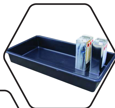
Model TT65 comes without removable grid