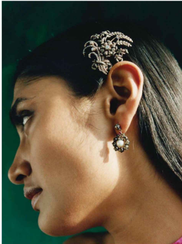
Earring, MOL Hair accessory, SHRI PARAMANI JEWELS Opposite page: Sari, ANAVILA. Necklace, MOL Earring, SHRI PARAMANI JEWELS