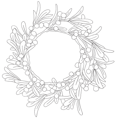
Mistletoe Wreath Stamp Set