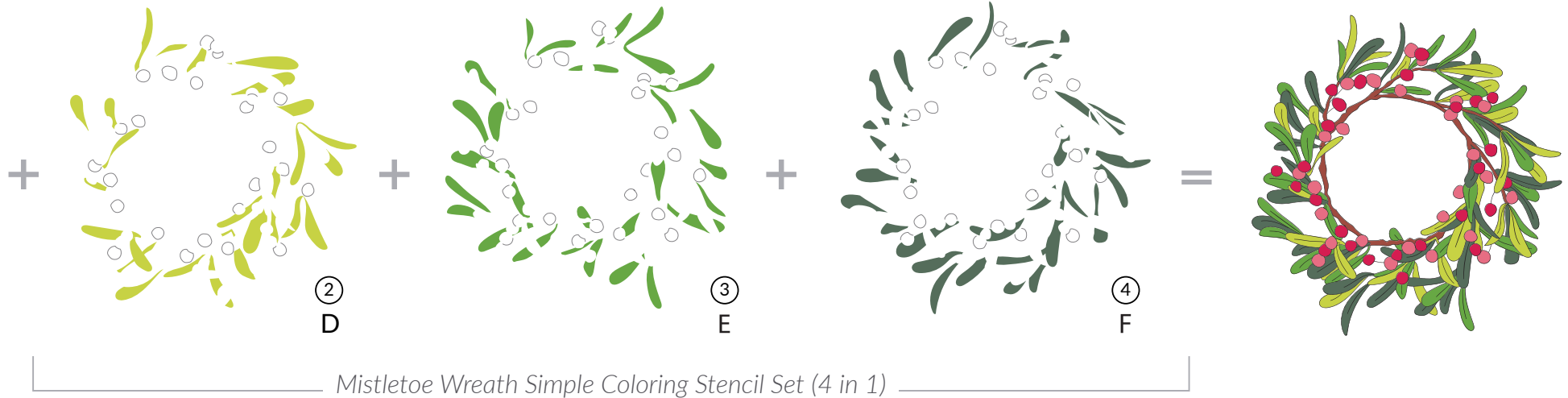
Mistletoe Wreath Simple Coloring Stencil Set (4 in 1)