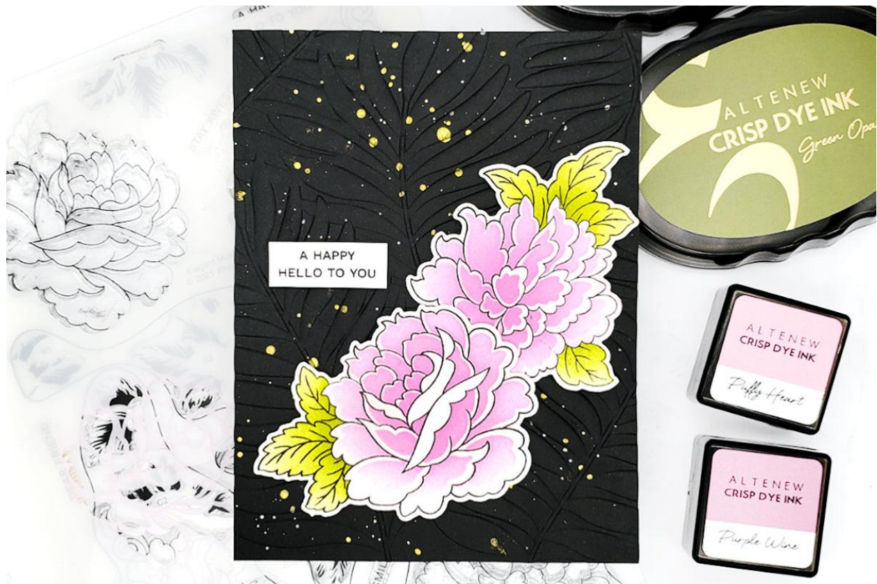
Areca Palm 3D Embossing Folder

And while the sky's the limit when it comes to what you can create, there are some basic paper craft supplies that every paper crafter should have in their tool kit. Let's discuss some of the essential tools for paper crafting, as well as a few handy supplies that you might want to add to your stash.