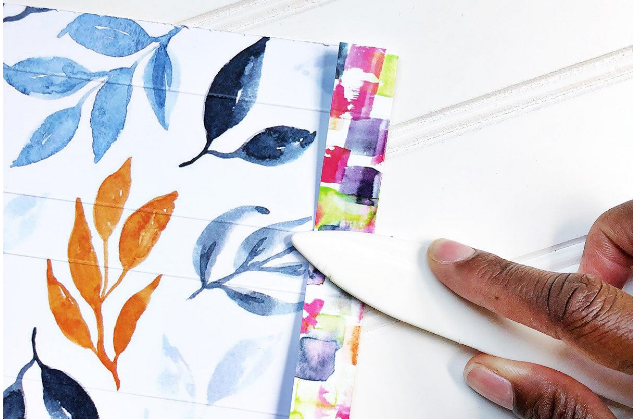
Crafter's Essential Bone Folder