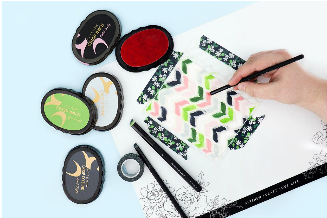
Detailed Blending Brushes