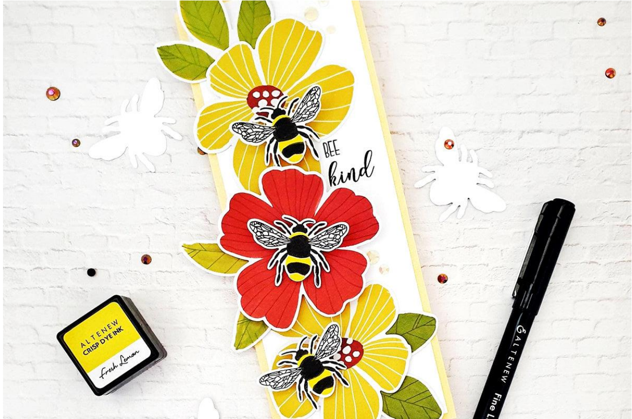
Mini Delight: Bee Kind Stamp & Die Set