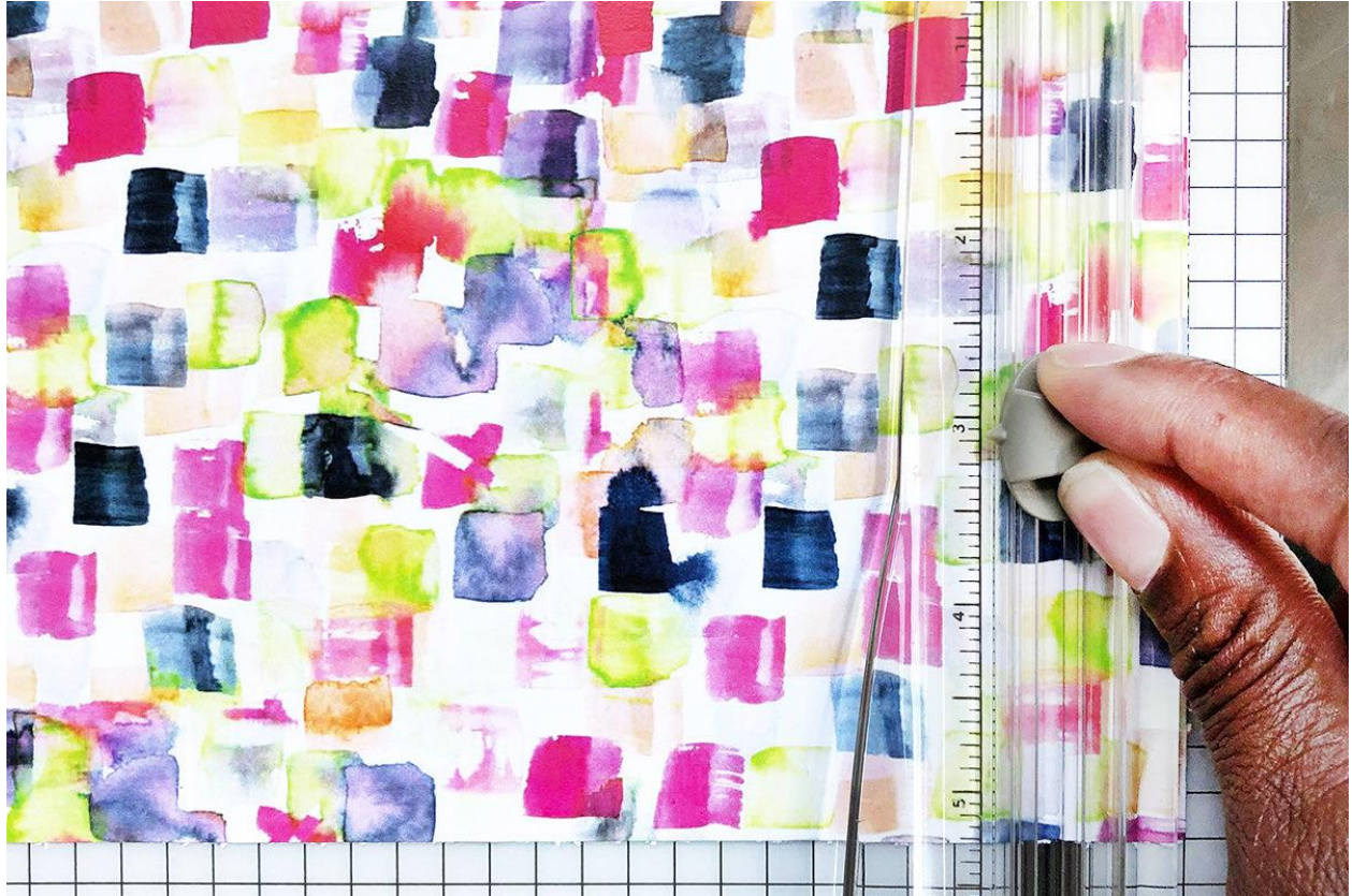
Live Your Dream 12x12 Paper Set

Whatever type of DIY craft you decide to do, you will need a paper trimmer to make sure that you get neat, straight, and professional trim every time. This is the best craft tool for producing clean cuts and cutting paper in bulk.