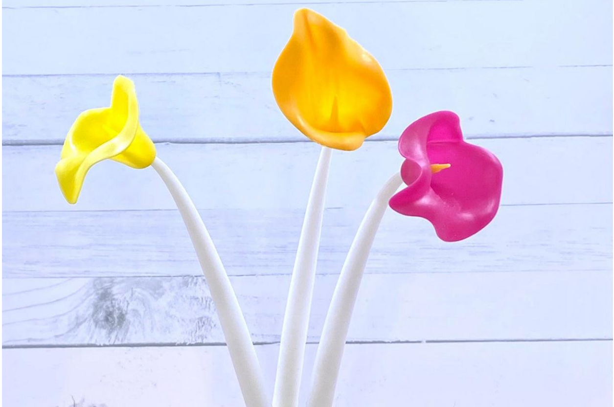
Flower Gel Pen Set - Calla Lily