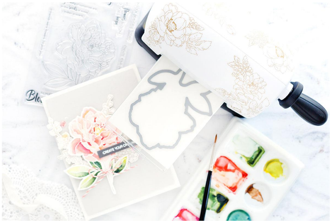
Mini Blossom Die Cutting Machine