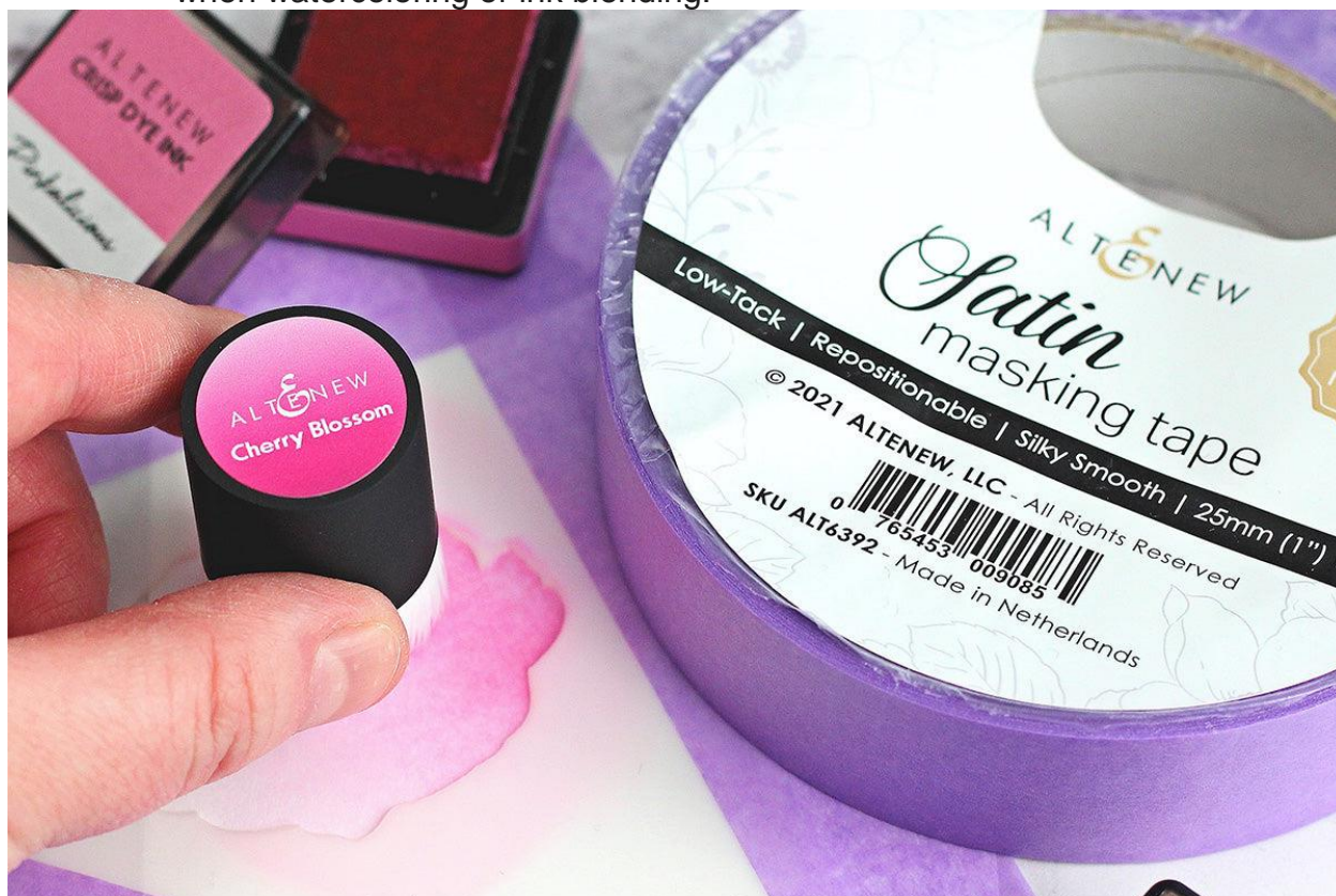
Satin Masking Tape