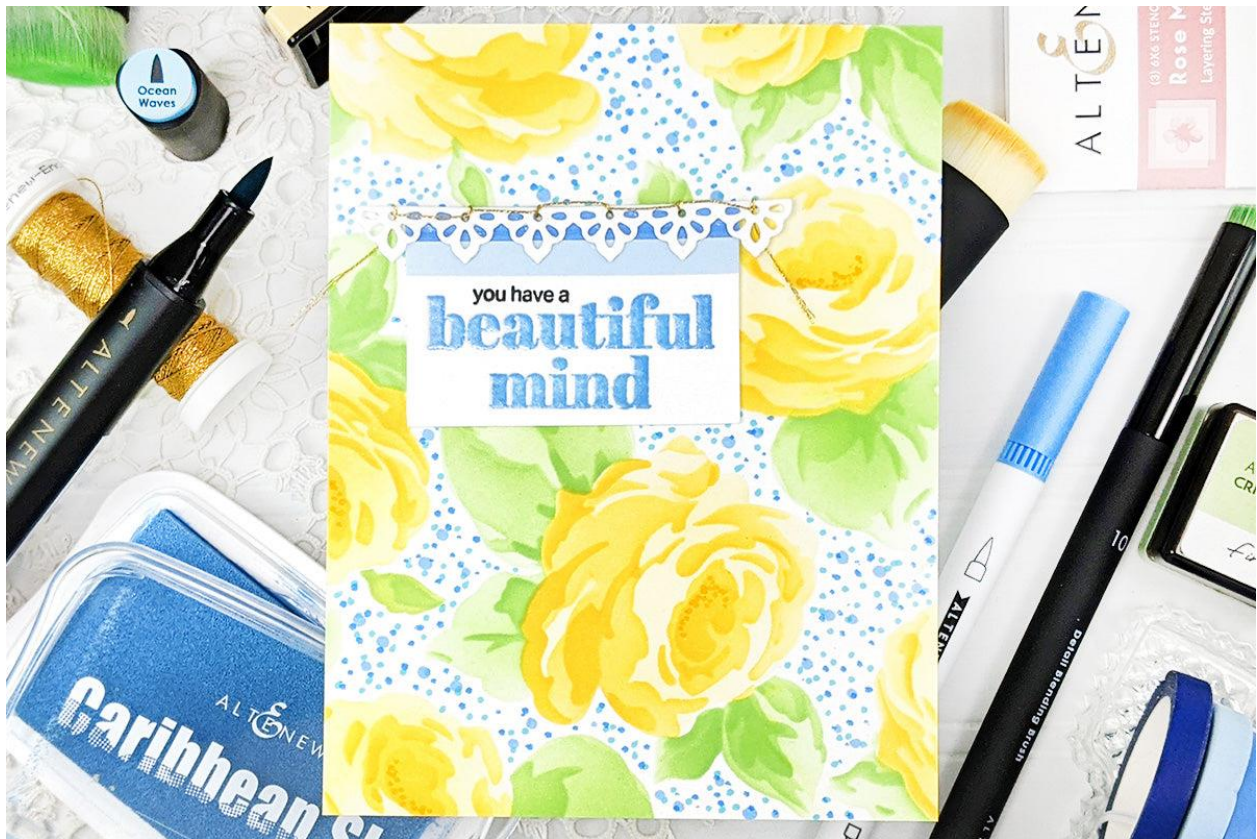
Rose Mellow Stencil Set (3 in 1)

If you're into paper crafting, you know the importance of having the right paper craft tools for the job. Whether you're making cards, scrapbook layouts, journaling, or just doodling on a piece of paper, having the right tools can make all the difference. In this quick guide, we'll take a look at some essential craft tools and supplies that every professional or beginner paper crafter should have in their arsenal. So whether you're just starting out in the world of DIY crafting or you're looking to add some new DIY craft supplies to your collection, read on for our checklist of must-have craft items!