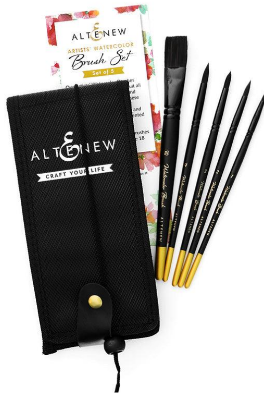
Artists' Watercolor Brushes Bundle