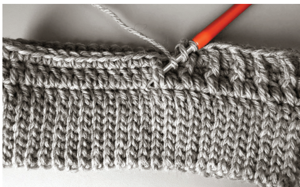
Demonstration of round 4

Rnd 4: Ch 3, *dc 1, FPTr into the dc from rnd 2* rep from * to * around, join with a sl st. Do NOT turn. (60 sts).