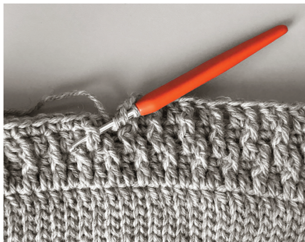
Demonstration of round 6

Rnd 6: Ch 3, *FPTr into the unused Dc from rnd 4, dc into next st* rep from * to * around, join with a sl st. Do NOT turn (60 sts)