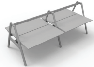
4 Pack Back 4PB