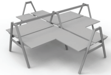
4 Pack Back with Return 4PBR