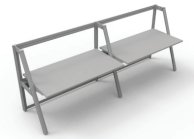
2 Pack Linear—2PL