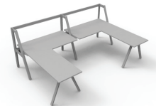
2 Pack Linear with Return 2PLR