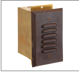
Model: SPJ17-VLP-LED Finish: Rusty

Finish: Our naturally etched finishes will withstand the test of time. All finishes are individually treated insuring consistency. Our meticulous application results in a fixture that truly becomes "a one of a kind".