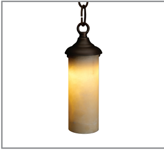
Model: SPJ-HOL-H2 Glass: Honey Onyx