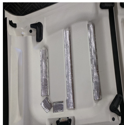
Front Panel, Pic D

Install Sound Assassin strip directly against small ridge. 3M tape on side panels must not touch sound assassin.