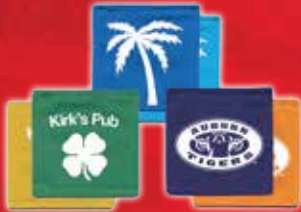
Custom & Replacement BAGGO® Bags