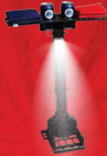
BAGGO® Caddy LITE