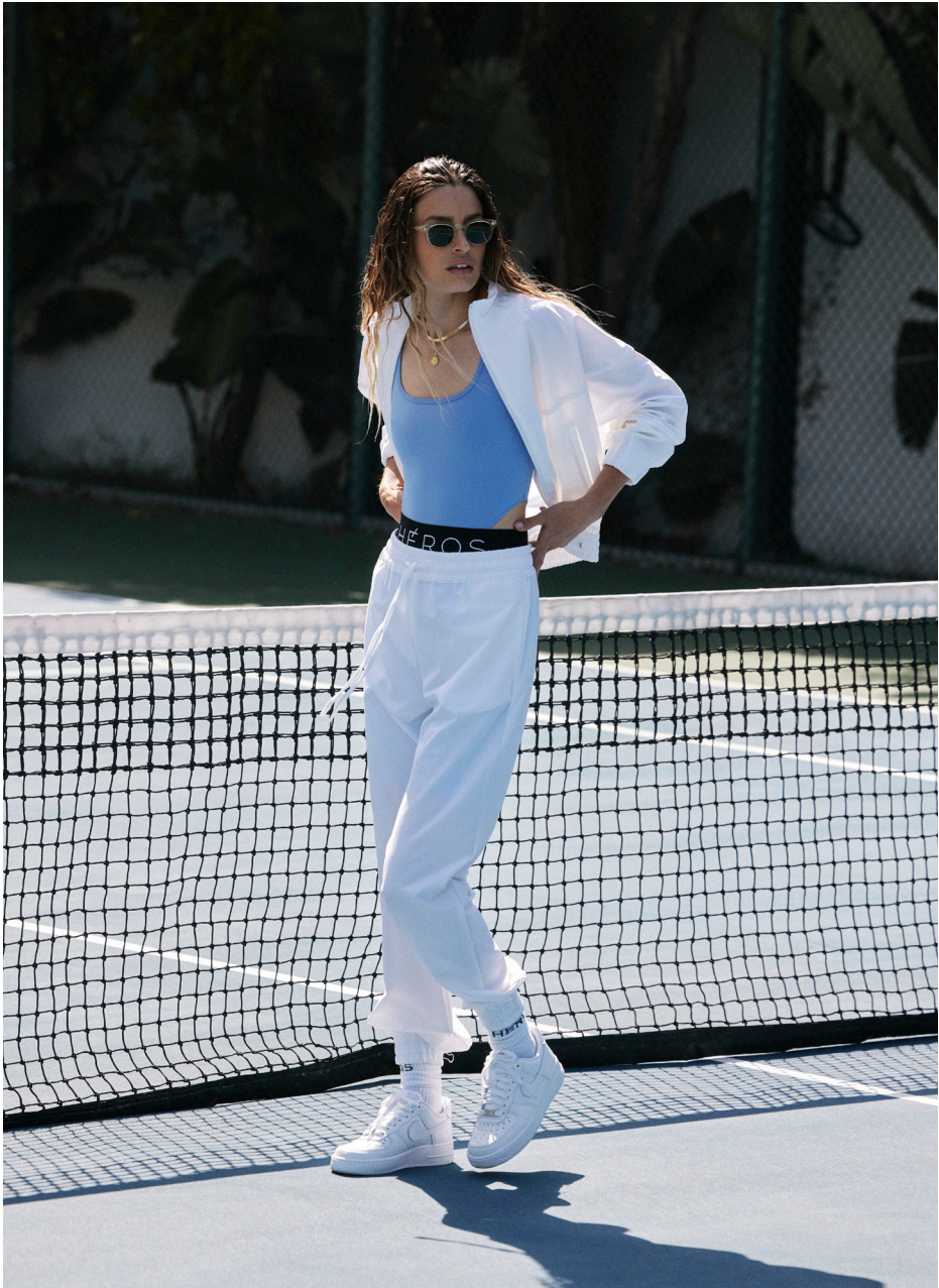
THE TRACK JACKET + THE TRACK PANT