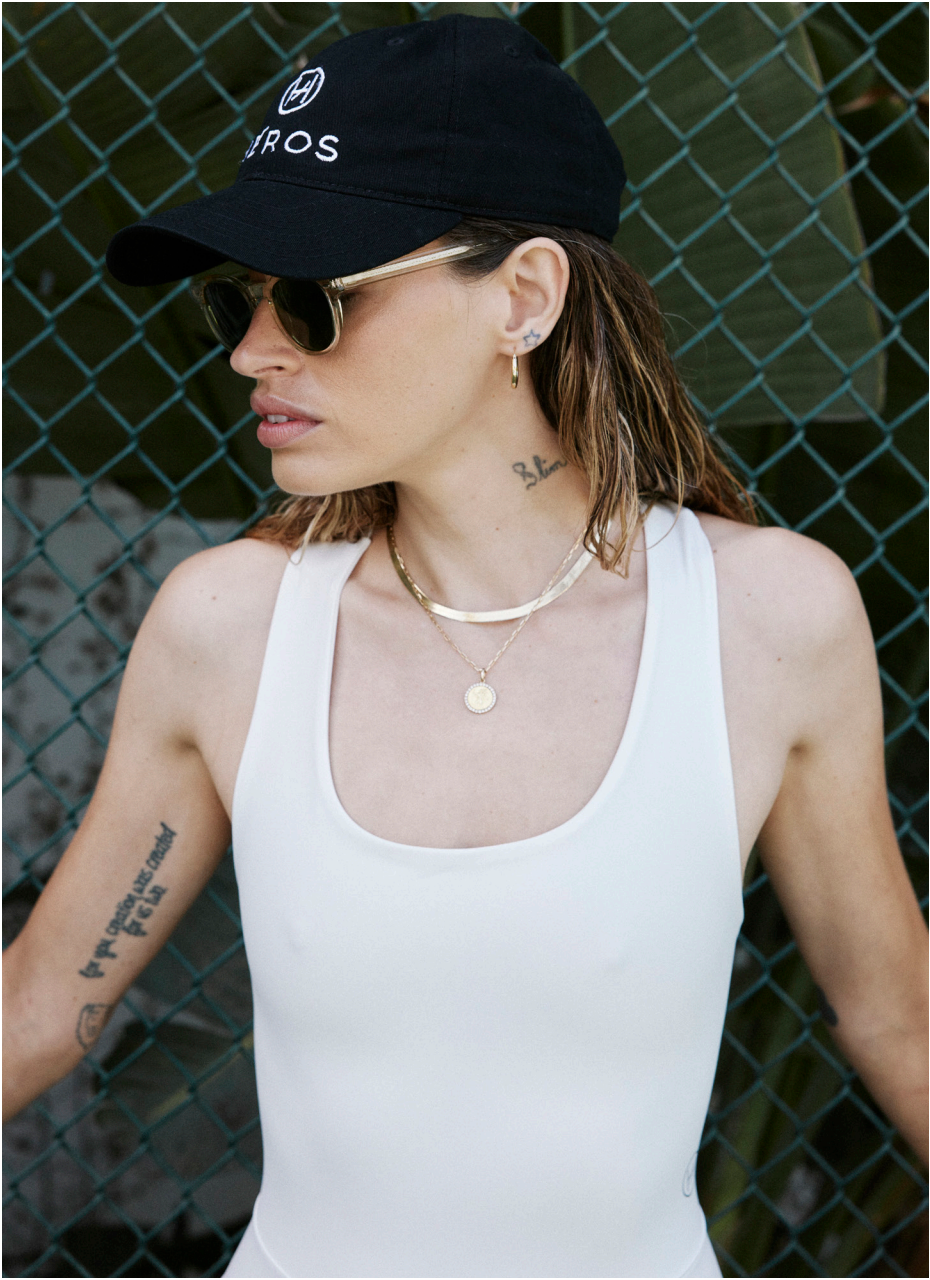
THE SHORT UNITARD