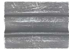
Two Colour Distress