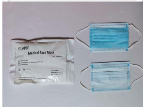
Photo of Samples

Note: Pass = Meet customer requirements; Fail = Fail customer requirements; # = No comment; N.D. = Not detected.