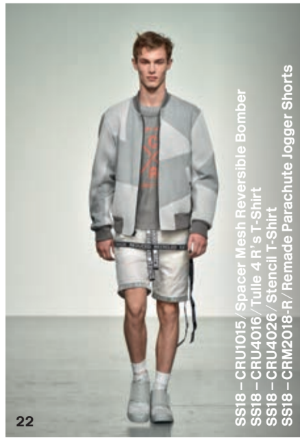
SS18 - CRU1015 / Spaces Mesh Reversible Bomber SS18 - CRU4016 / Tulle 4 R's T-Shirt SS18 - CRU4026 / Space all T-Shirt SS18 - CRM2016-R / Remade Parachute Jogger Shorts