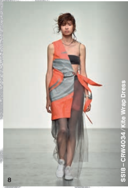
SS18 - CRW4034 / Kite Wrap Dress