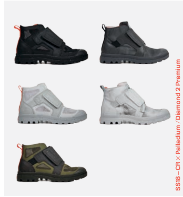
SS18 - CR x Palladium / Diamond 2 Premium