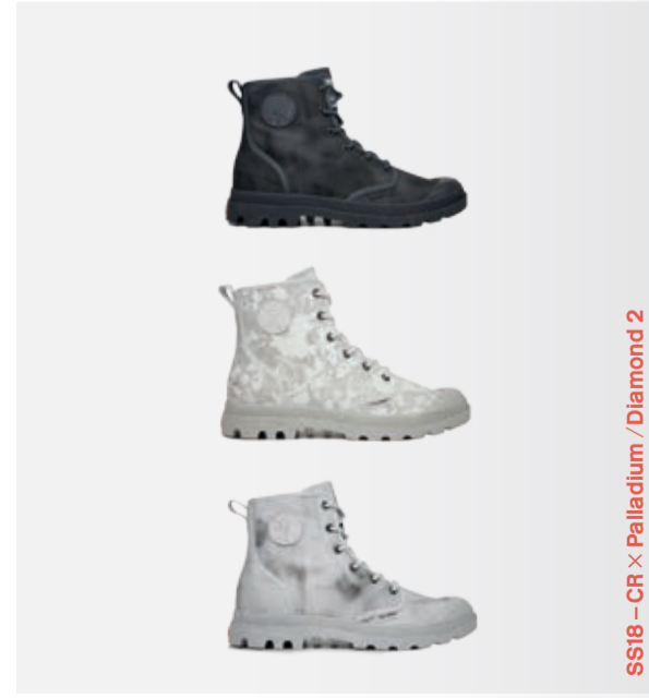
SS18 - CR x Palladium / Diamond 2