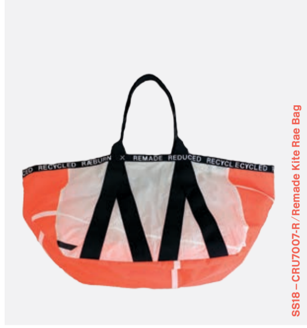
SS18 - CRU7007-R / Remade Kite Rae Bag