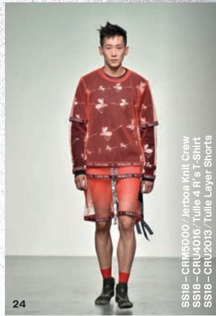
SS18 - CRM6000 / Jerboa Knit Crew SS18 - CRU4016 / Tulle 4 R's T-Shirt SS18 - CRU2013 / Tulle Layer Shorts