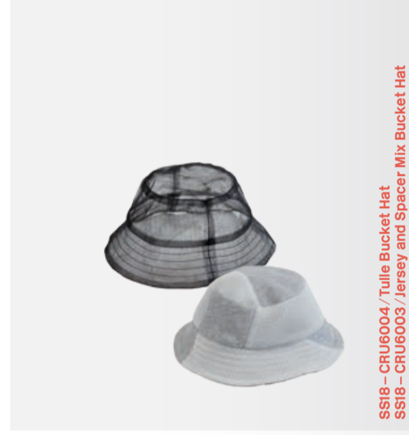
SS18 - CRU6004 / Tulle Bucket Hat SS18 - CRU6003 / Jersey and Spacer Mix Bucket Hat