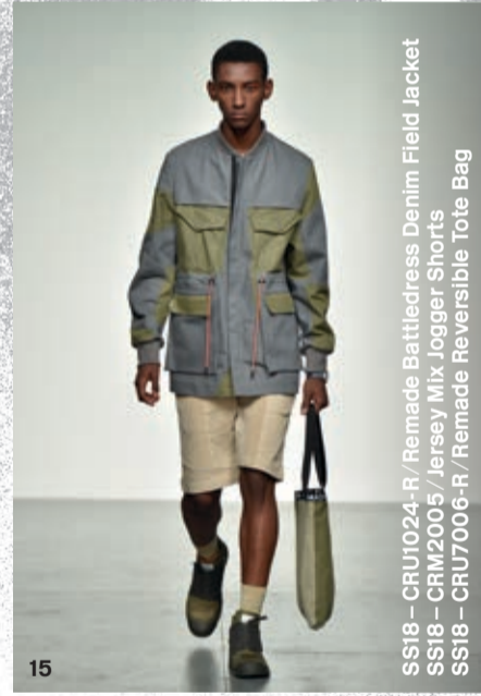
SS18 - CRU1024-R / Remade Battledress Denim Field Jacket SS18 - CRM2005 / Jersey Mix Jogger Shorts SS18 - CRU7006-R / Remade Reversible Tote Bag