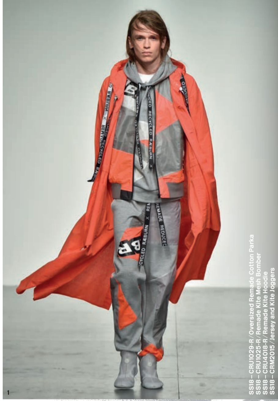
SS18 - CRU1029-R / Oversized Remade Cotton Parka SS18 - CRU1025-R / Remade Kite Mesh Bomber SS18 - CRU4018-R / Remade Kite Hoodie SS18 - CRM2015 / Jersey and Kite Joggers