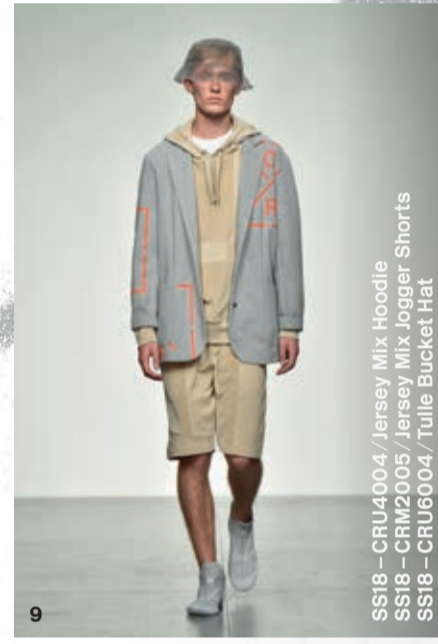
SS18 - CRU4004 / Jersey Mix Hoodie SS18 - CRM2009 / Jersey Mix Jogger Shorts SS18 - CRU6004 / Tulle Bucket Hat