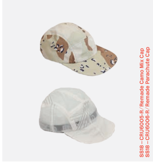
SS18 - CRU6005-R / Remade Camo Mix Cap SS18 - CRU6006-R / Remade Parachute Cap