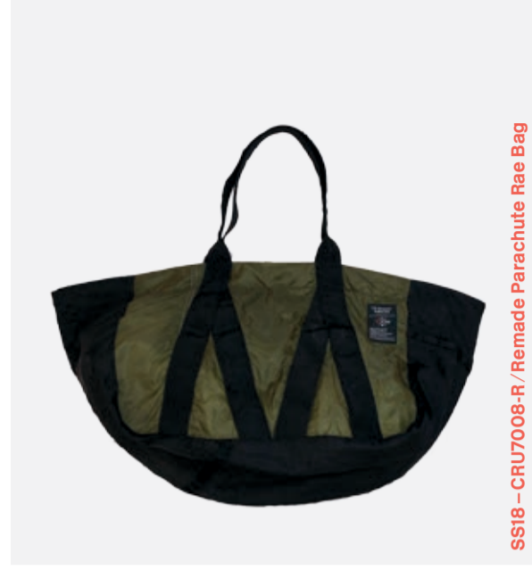
SS18 - CRU7008-R / Remade Parachute Rae Bag