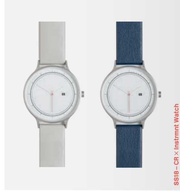
SS18 - CR x Instrmnt Watch