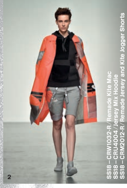
SS18 - CRW1032-R / Remade Kite Mac SS18 - CRU4004 / Jersey Mix Hoodie SS18 - CRM2012-R / Remade Jersey and Kite Jogger Shorts