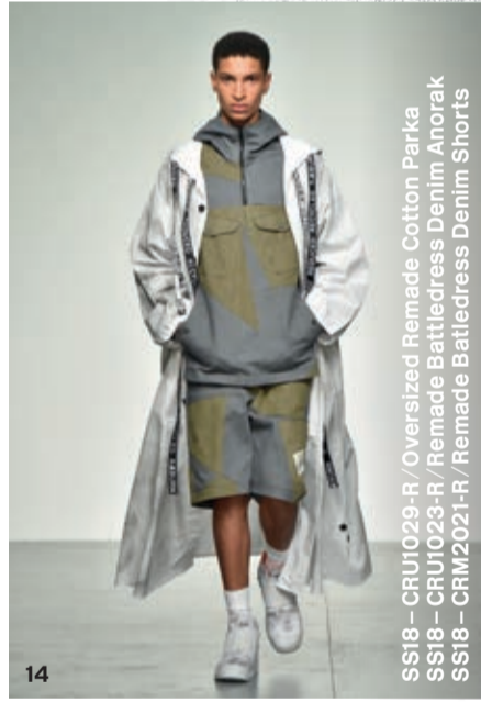
SS18 - CRU1029-R / Oversized Remade Cotton Parka SS18 - CRU1023-R / Remade Battledress Denim Anorak SS18 - CRM2021-R / Remade Battledress Denim Shorts