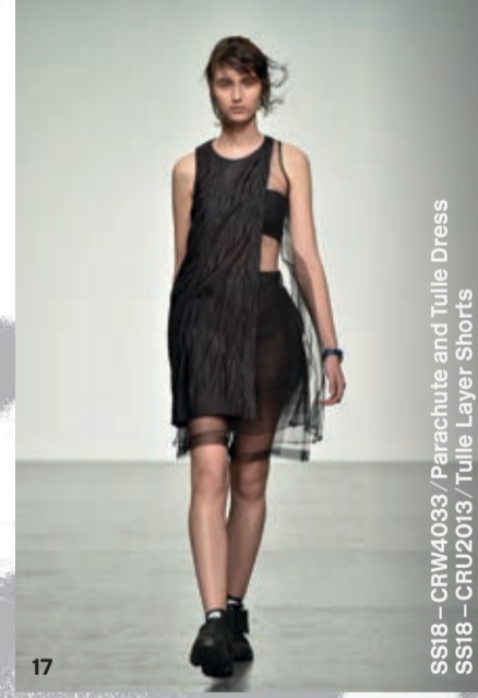
SS18 - CRW4039 / Parachute and Tulle Dress SS18 - CRU2013 / Tulle Layer Shorts