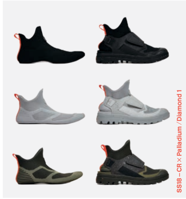
SS18 - CR x Palladium / Diamond 1