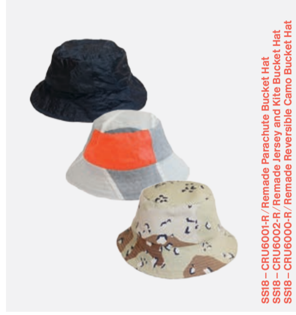
SS18 - CRU6001-R / Remade Parachute Bucket Hat SS18 - CRU6002-R / Remade Jersey and Kite Bucket Hat SS18 - CRU6000-R / Remade Reversible Camo Bucket Hat