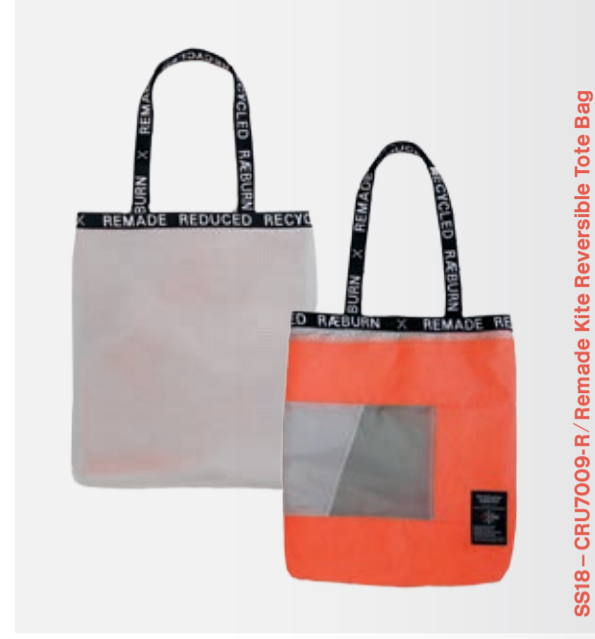
SS18 - CRU7009-R / Remade Kite Reversible Tote Bag