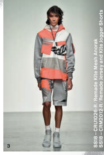
SS18 - CRU1026-R / Remade Kite Mesh Anorak SS18 - CRM2012-R / Remade Jersey and Kite Jogger Shorts