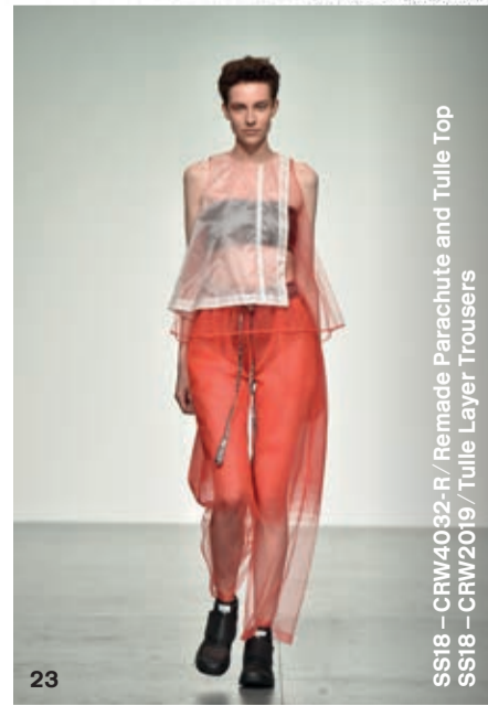
SS18 - CRW4032-R / Remade Parachute and Tulle Top SS18 - CRW2019 / Tulle Layer Trousers