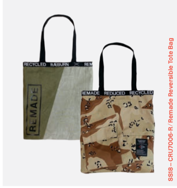
SS18 - CRU7006-R / Remade Reversible Tote Bag