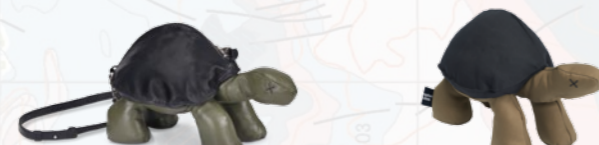
SS15 - ATORT / Tortoise Bag SS15 / R - Tortoise