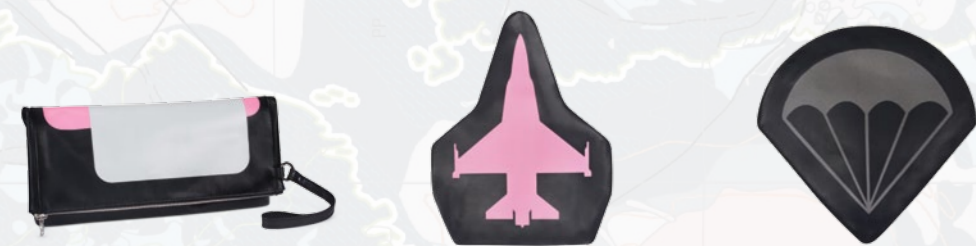
SS15 - APC / Patch Clutch SS15 - AAC / Aeroplane Clutch SS15 - APAC / Parachute Clutch