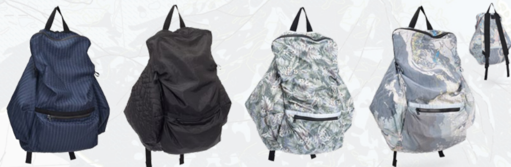
SS15 - APACR / Packaway Rucksack