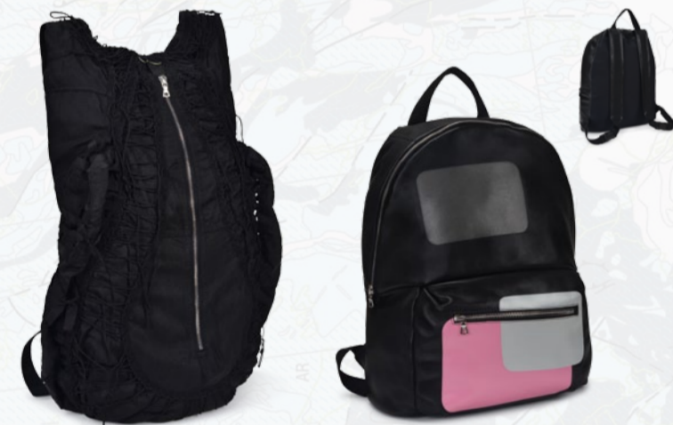
SS15 - ARR / Remade Mig Rucksack SS15 - APR / Patch Rucksack