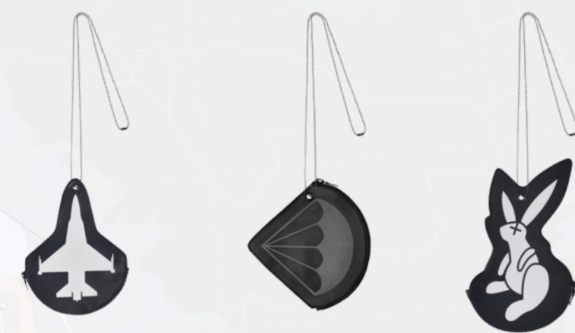
SS15 - AAP / Aeroplane Purse SS15 - APP / Parachute Purse SS15 - AHP / Hare Purse