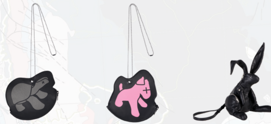
SS15 - ATP / Tortoise Purse SS15 - AMP / Mutt Purse SS15 - AHARE / Hare Bag