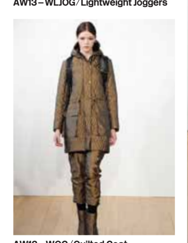
AW13 - WQC/Quilted Coat AW13-WLJOG/Lightweight Joggers AW13-WDJUMP/Wool Jumpsuit