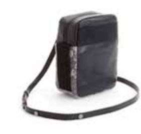
AW13 - ABOX/Box Bag