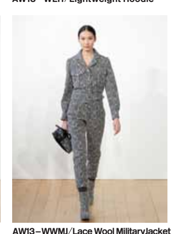
AW13 - WWTD / Wool T-Shirt Dress AW13 - WWBOM / Lace Wool Bomber AW13 - WWMJ / Lace Wool Military Jacket AW13-WLJOG/Lightweight Joggers AW13-WWTRS/Wool Trousers