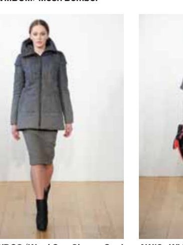
AW13 – WDCS/Wool Cap Sleeve Coat AW13 – WLTD/Linen-silk T-Shirt Dress AW13 – WMDR/Mesh Dress