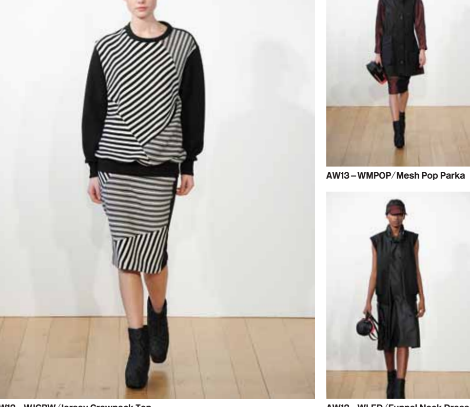
AW13 – WLFD/Funnel Neck Dress AW13 – WMG/Mesh Gilet AW13 – WJCRW/Jersey Crewneck Top AW13 – WJSK/Jersey Pencil Skirt