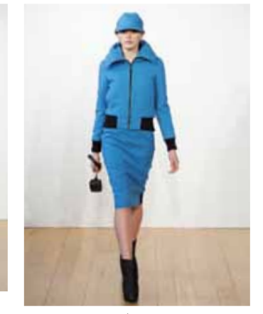
AW13-WDBOM/Wool Bomber AW13 - WWC/Winter Cap