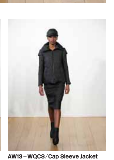
AW13 - WWC/Winter Cap