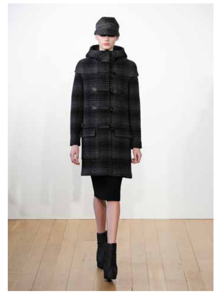
AW13 - WDUF/Wool Duffle Coat AW13 - WWC/Winter Cap