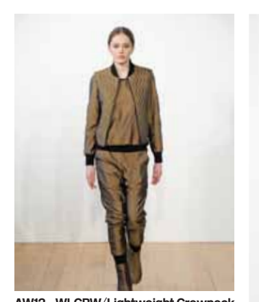
AW13-WLCRW/Lightweight Crewneck AW13-WQG/Quilted Gilet AW13-WLJOG/Lightweight Joggers