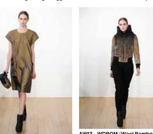
AW13-WDBOM/Wool Bomber AW13 - WQTD/Quilted T-Shirt Dress AW13 - WWTRS/Wool Trousers