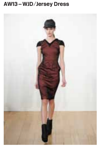
AW13 - WJSD/Knit Dress AW13 - WWC/Winter Cap