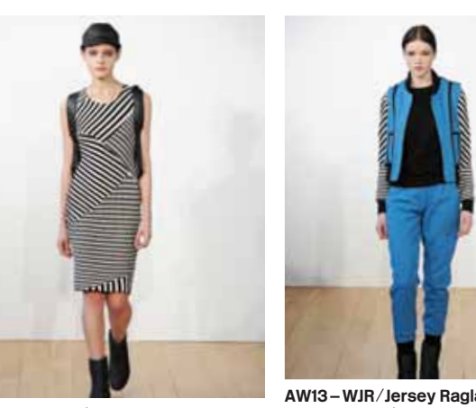
AW13-WJR/Jersey Raglan Top AW13-WWG/Wool Gilet AW13-WWTRS/Wool Trousers