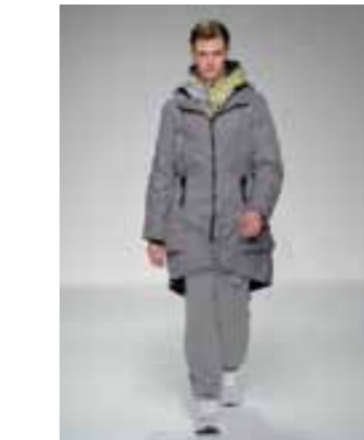
AW13-MLP/ Mens lightweight Parka