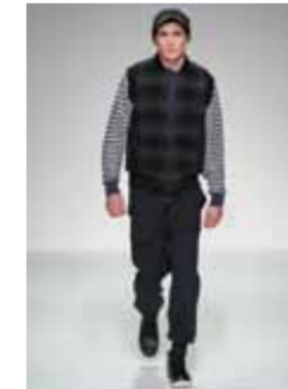
AW13-MWG/ Wool Gilet