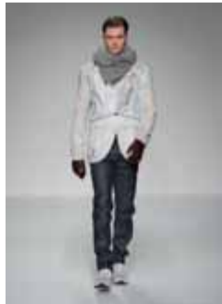
AW13-MRSI/ Map Suit Jacket