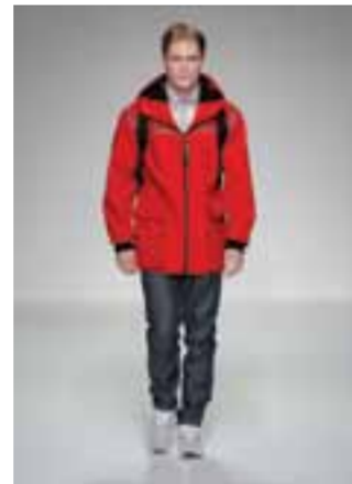
AW13-MWJ/ Wool Mid Length