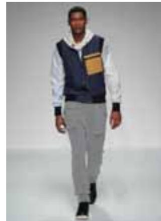
AW13-MZG/ Quilted Gilet