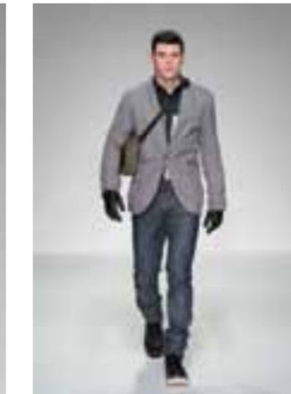
AW13-MLSJ/ Lightweight Suit Jacket