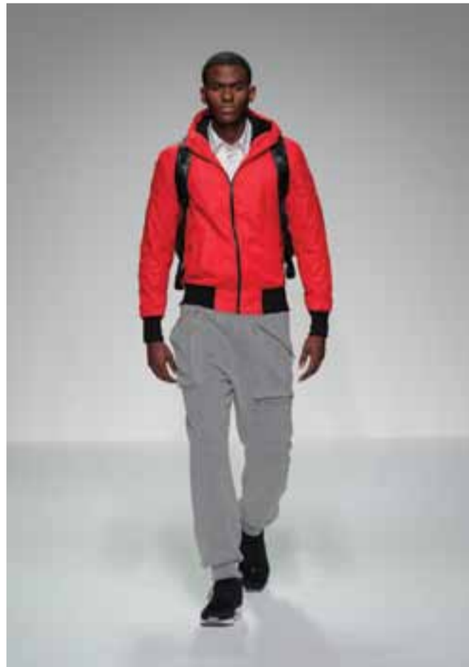
AW13-MLBOM/ Lightweight Bomber