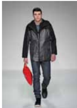
AW13-MRPOJ/ Remade Pop-outer