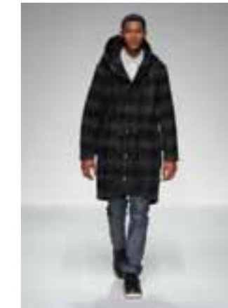
AW13-MWP/ Wool Parka