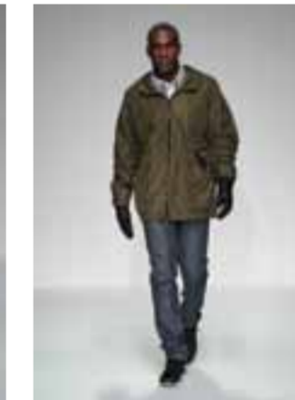
AW13-MLMJ/ Lightweight Jacket