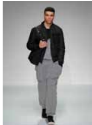
AW13-MZBOM/ Quilted Bomber