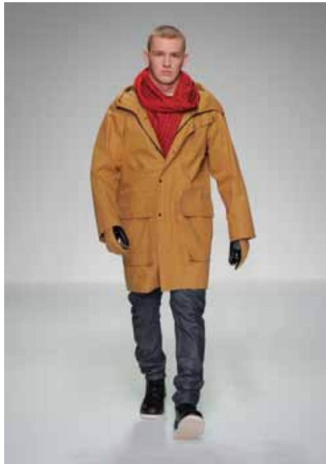
AW13-MPOM/ Pop-out Mac