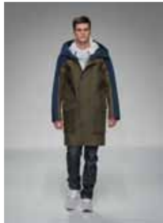
AW13-MRPOM/ Remade Pop-out Mac