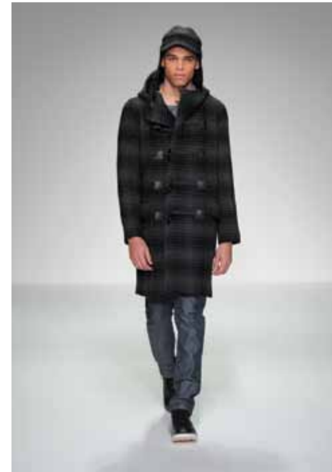
AW13-MWDUF/ Wool Duffle Coat