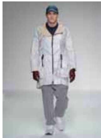
AW13-MREVP/ Reversible Parka