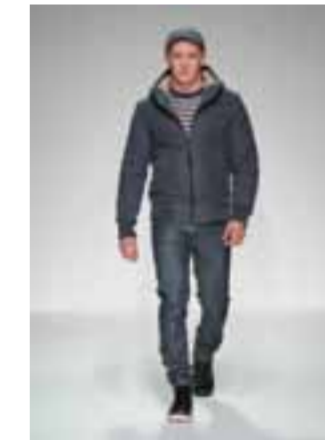
AW13-MRBB/ Blanket Bomber