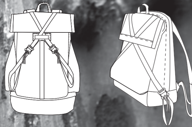
AW13-ALRUCK/ Large Rucksack AW13-ARRUCK/ Remade Rucksack