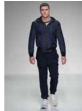
AW13-MLBOM/ Lightweight Bomber