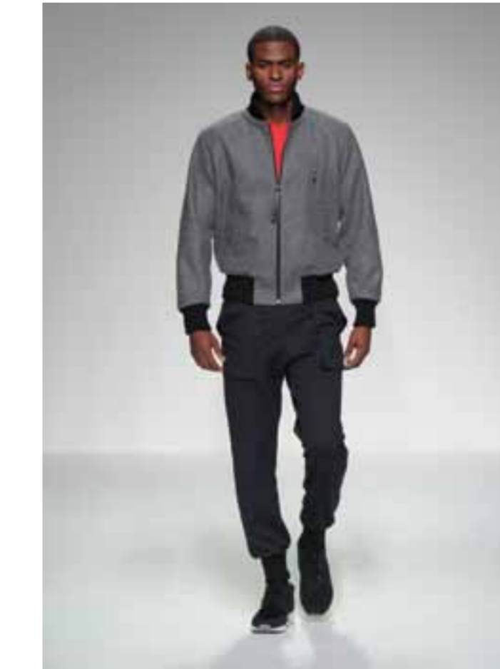
AW13-MWBOM/ Wool Bomber