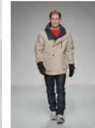
AW13-MRC/ Reversible Coat