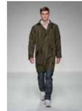
AW13-MLM/ Lightweight Mac