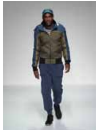
AW13-MRBOM/ Remade Bomber