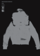
4. 8201-8205 Wood Parka