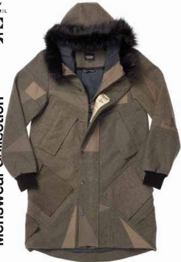
AW11 – MMI/Inuit Coat