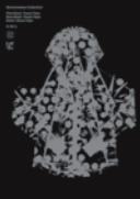
12. 8201-8205 Parallel Hood