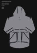
8. 8201-8205 Parallel Coat