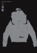
24. 8201-8205 Wood Parka