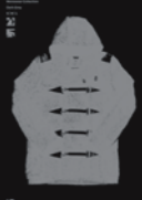
16. 8201-8205 Duffin Coat