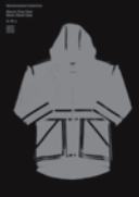
28. 8201-8205 Parallel Coat