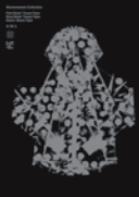
32. 8201-8205 Parallel Hood