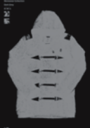
36. 8201-8205 Duffin Coat