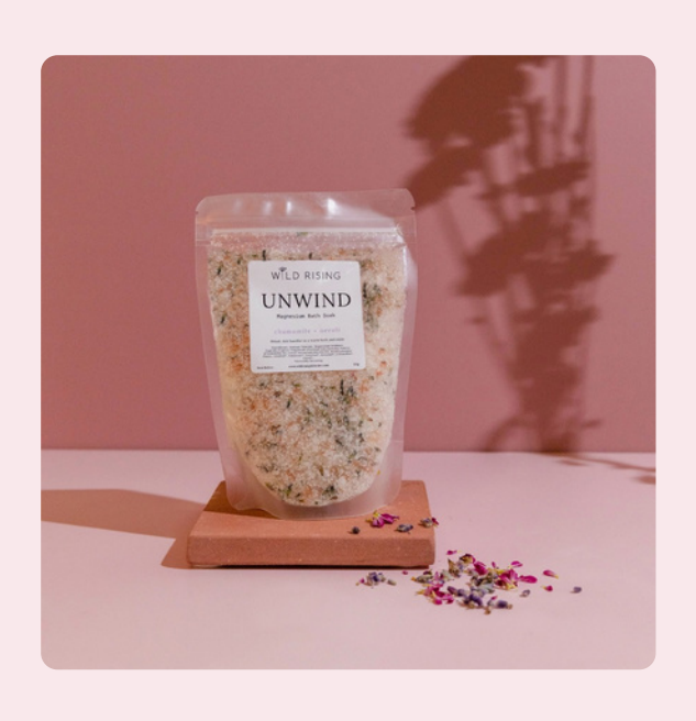
UNWIND | HIMALAYAN BATH SOAK

Uplift bath salts contain a high concentration of Epsom Salt together with Orange, Lemon and Peppermint essential oils which will boost your mood and energy, whilst easing anxiety, improving your concentration and soothing tired muscles.