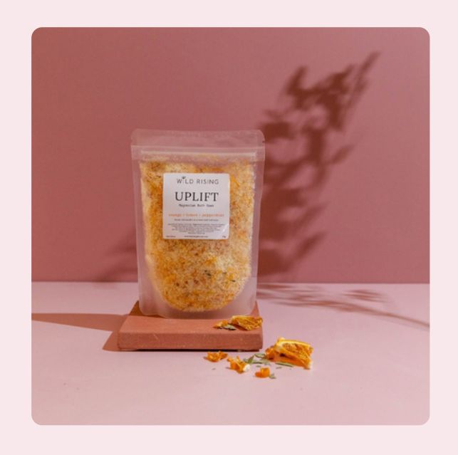
UPLIFT | MAGNESIUM BATH SOAK

Awaken bath salts contain a blend of Pink Himalayan and Epsom Salt in addition to Lavender, Jasmine and Rose essential oils, all combined together with moisturising Coconut Oil.