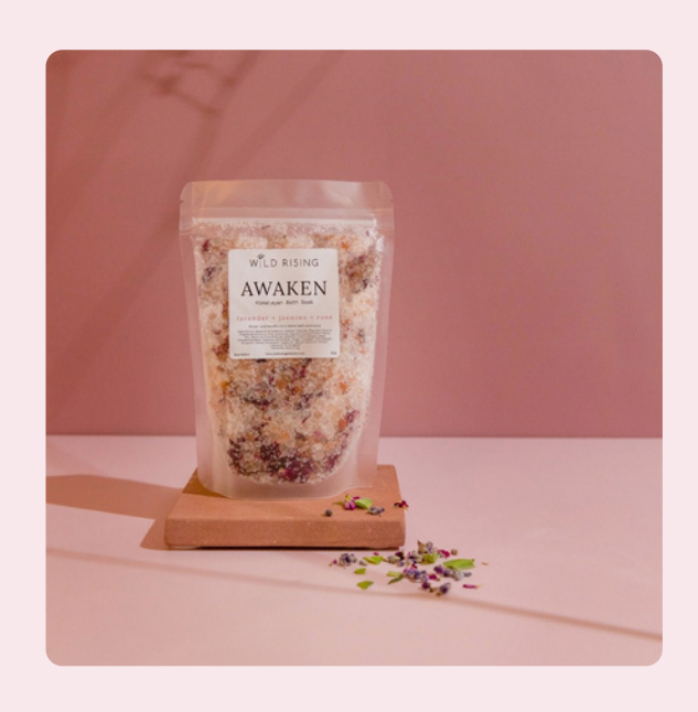
AWAKEN | HIMALAYAN BATH SOAK

Awaken bath salts contain a blend of Pink Himalayan and Epsom Salt in addition to Lavender, Jasmine and Rose essential oils, all combined together with moisturising Coconut Oil.