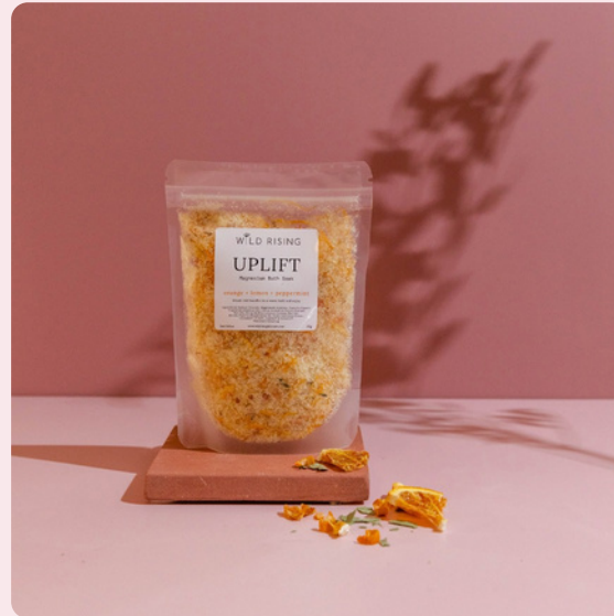
UPLIFT | MAGNESIUM BATH SOAK

Awaken bath salts contain a blend of Pink Himalayan and Epsom Salt in addition to Lavender, Jasmine and Rose essential oils , all combined together with moisturising Coconut Oil.