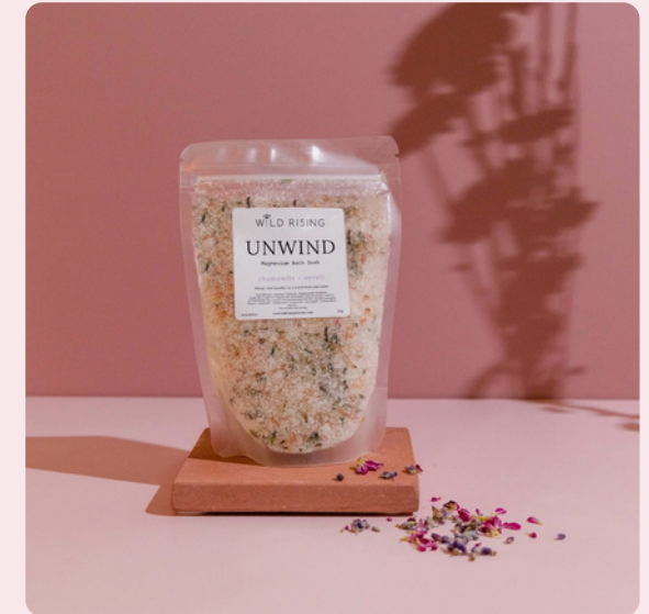
UNWIND | HIMALAYAN BATH SOAK

Uplift bath salts contain a high concentration of Epsom Salt together with Orange, Lemon and Peppermint essential oils which will boost your mood and energy, whilst easing anxiety, improving your concentration and soothing tired muscles.