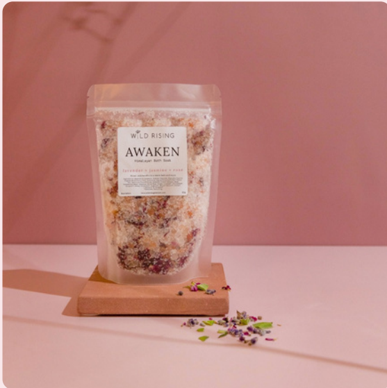
AWAKEN | HIMALAYAN BATH SOAK

Awaken bath salts contain a blend of Pink Himalayan and Epsom Salt in addition to Lavender, Jasmine and Rose essential oils , all combined together with moisturising Coconut Oil.